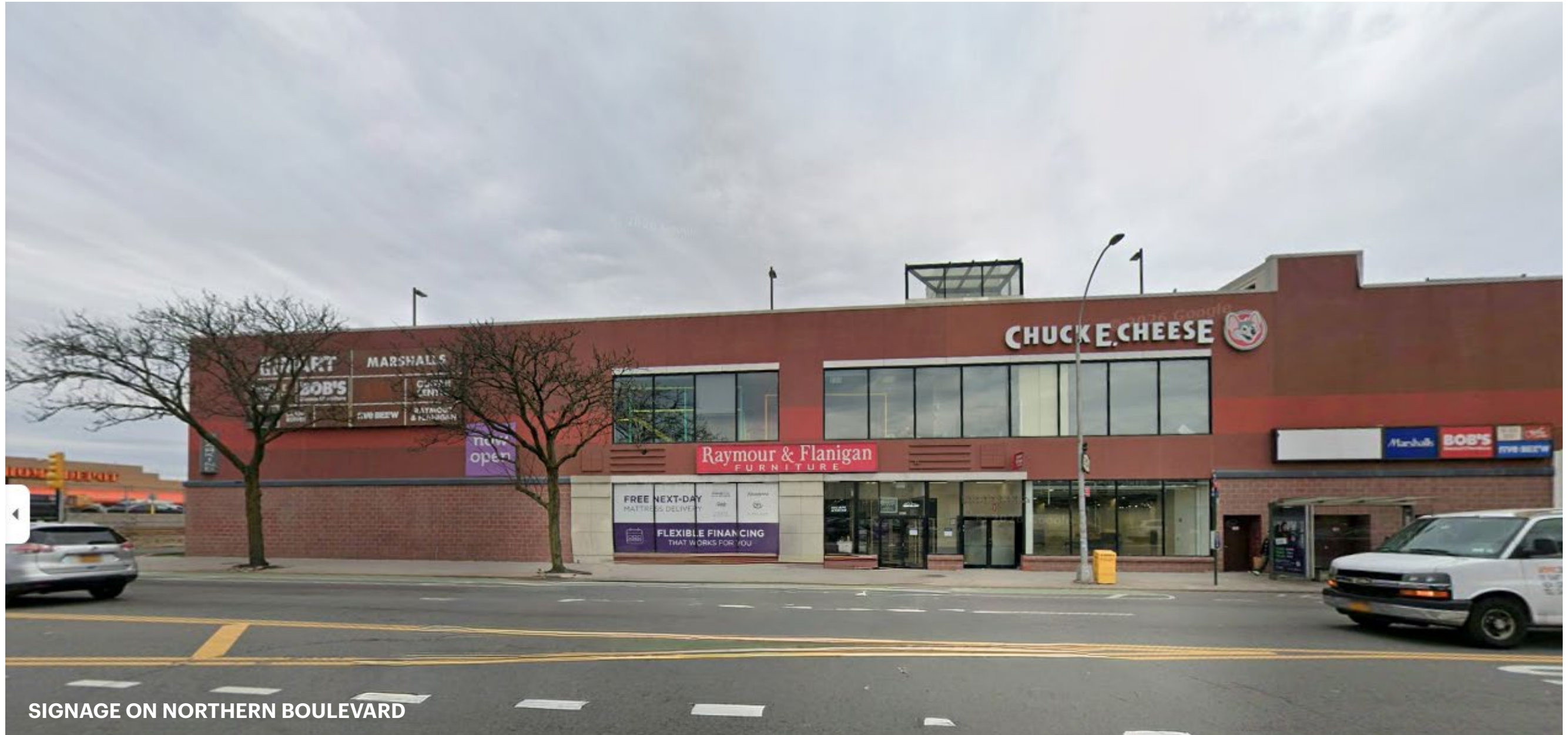
SIGNAGE ON NORTHERN BOULEVARD