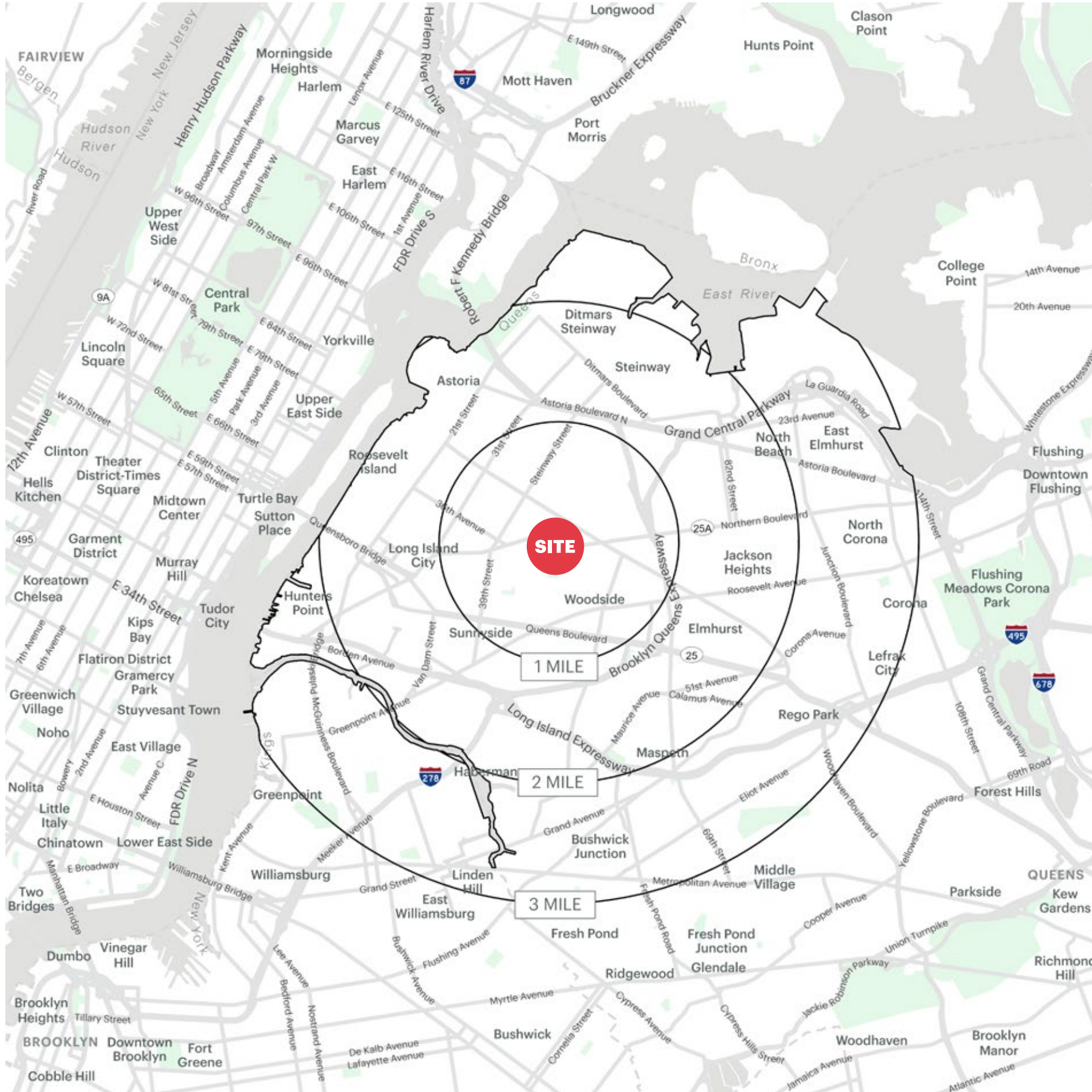
SHOPS AT NORTHERN BOULEVARD LONG ISLAND CITY, NEW YORK