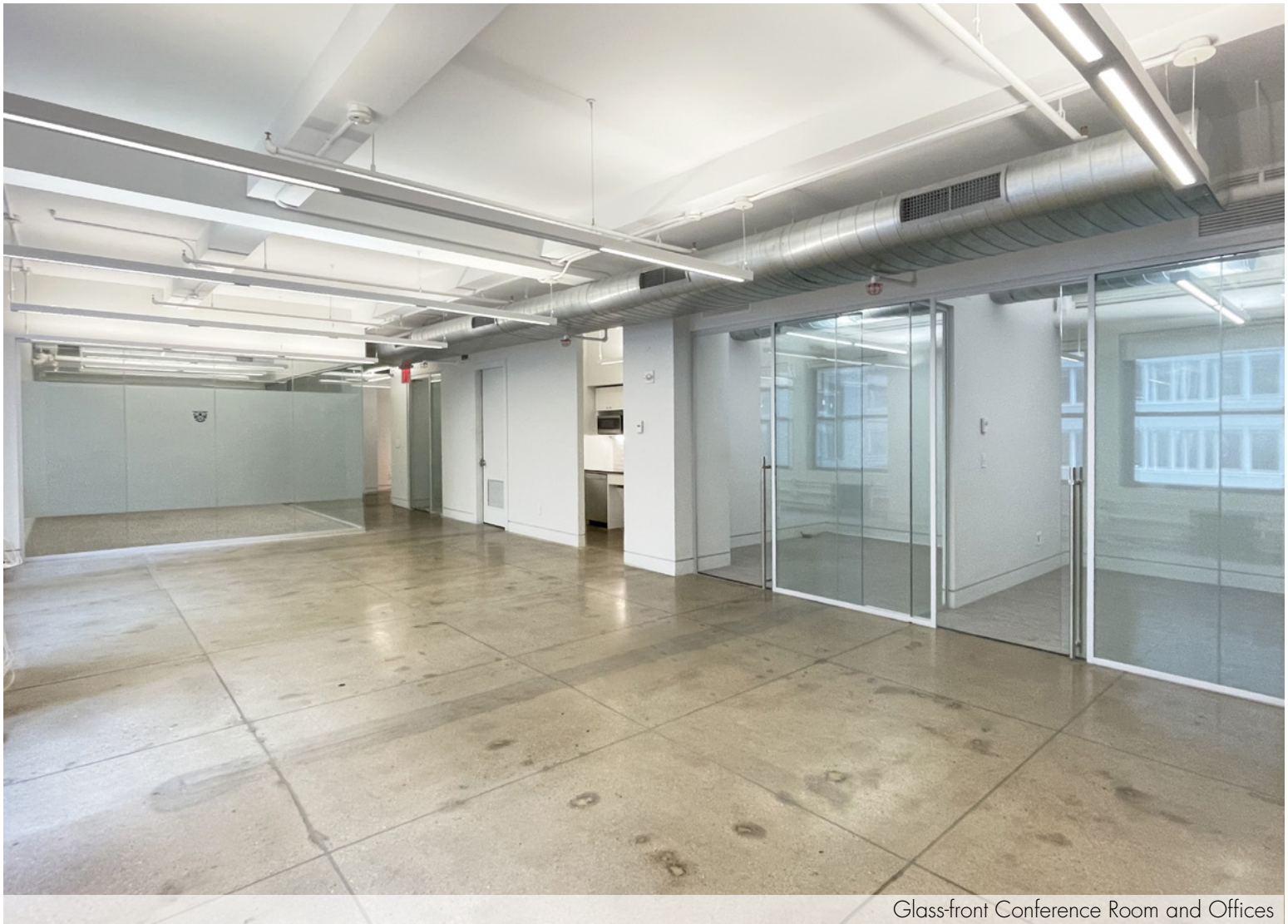
Glass-front Conference Room and Offices

ABS Partners Real Estate, as the exclusive agent is pleased to offer the following opportunity for lease: