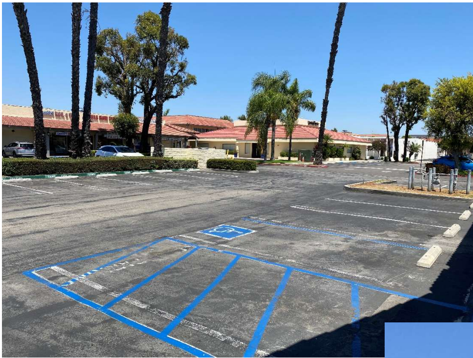
View from across Los Alamitos