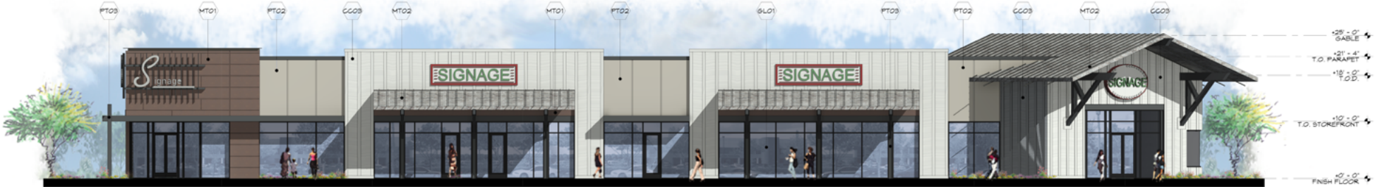
1 SOUTH ELEVATION SCALE: 1/8" = 1'-0"