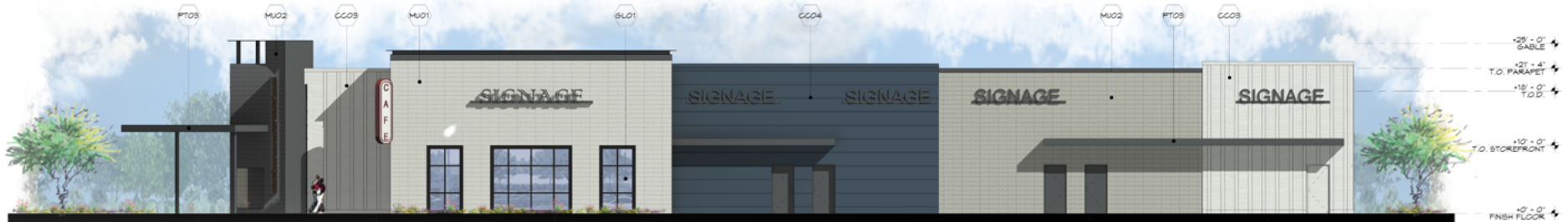
4 NORTH ELEVATION SCALE: 1/8" = 1'-0"