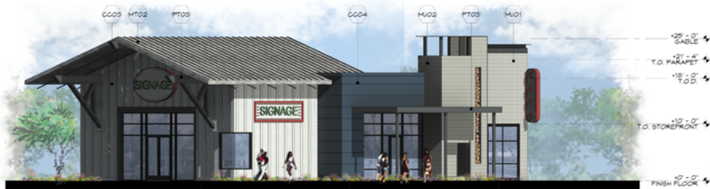
2 EAST ELEVATION SCALE: 1/8" = 1'-0"