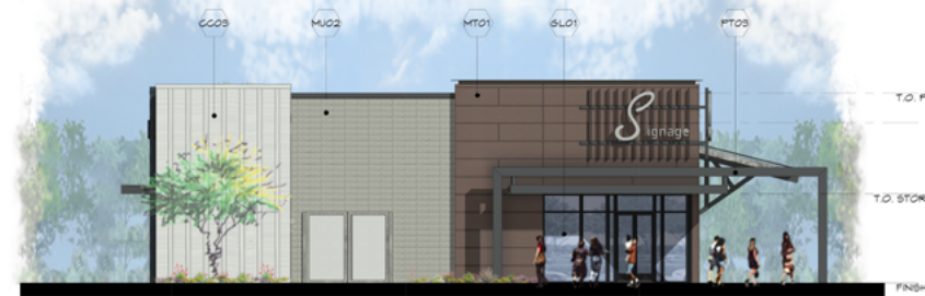
3 WEST ELEVATION SCALE: 1/8" = 1'-0"