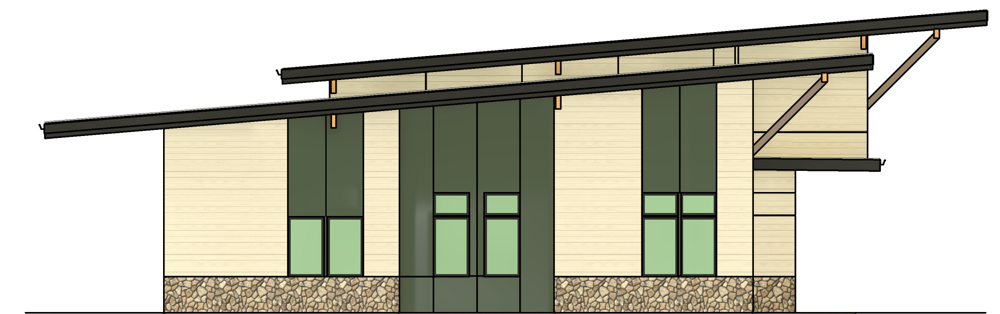
EAST ELEVATION 1/8" = 1'-0"