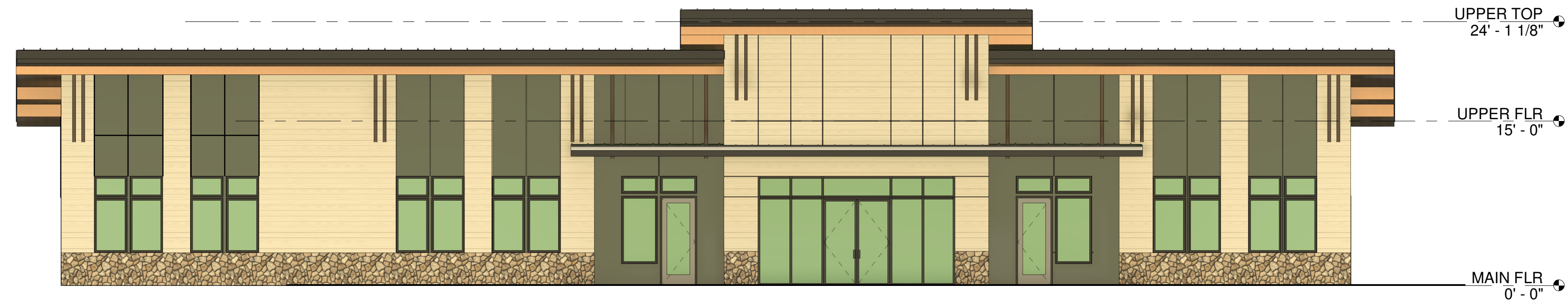
NORTH ELEVATION 1/8" = 1'-0"