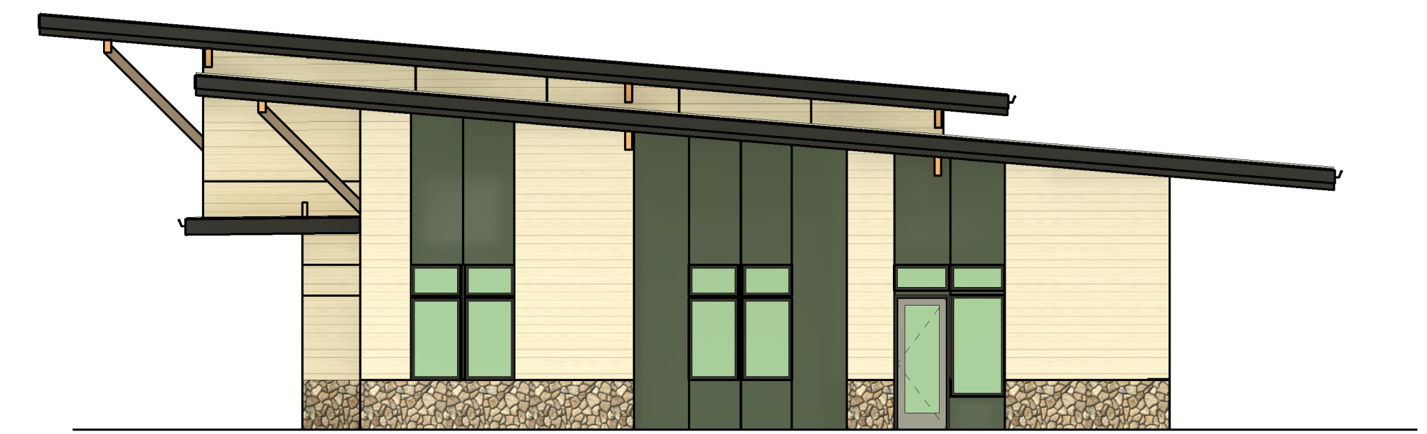
WEST ELEVATION 1/8" = 1'-0"