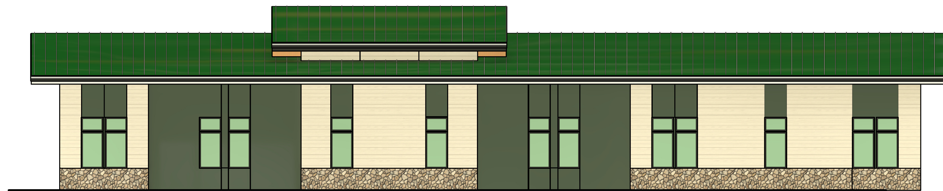
SOUTH ELEVATION 1/8" = 1'-0"