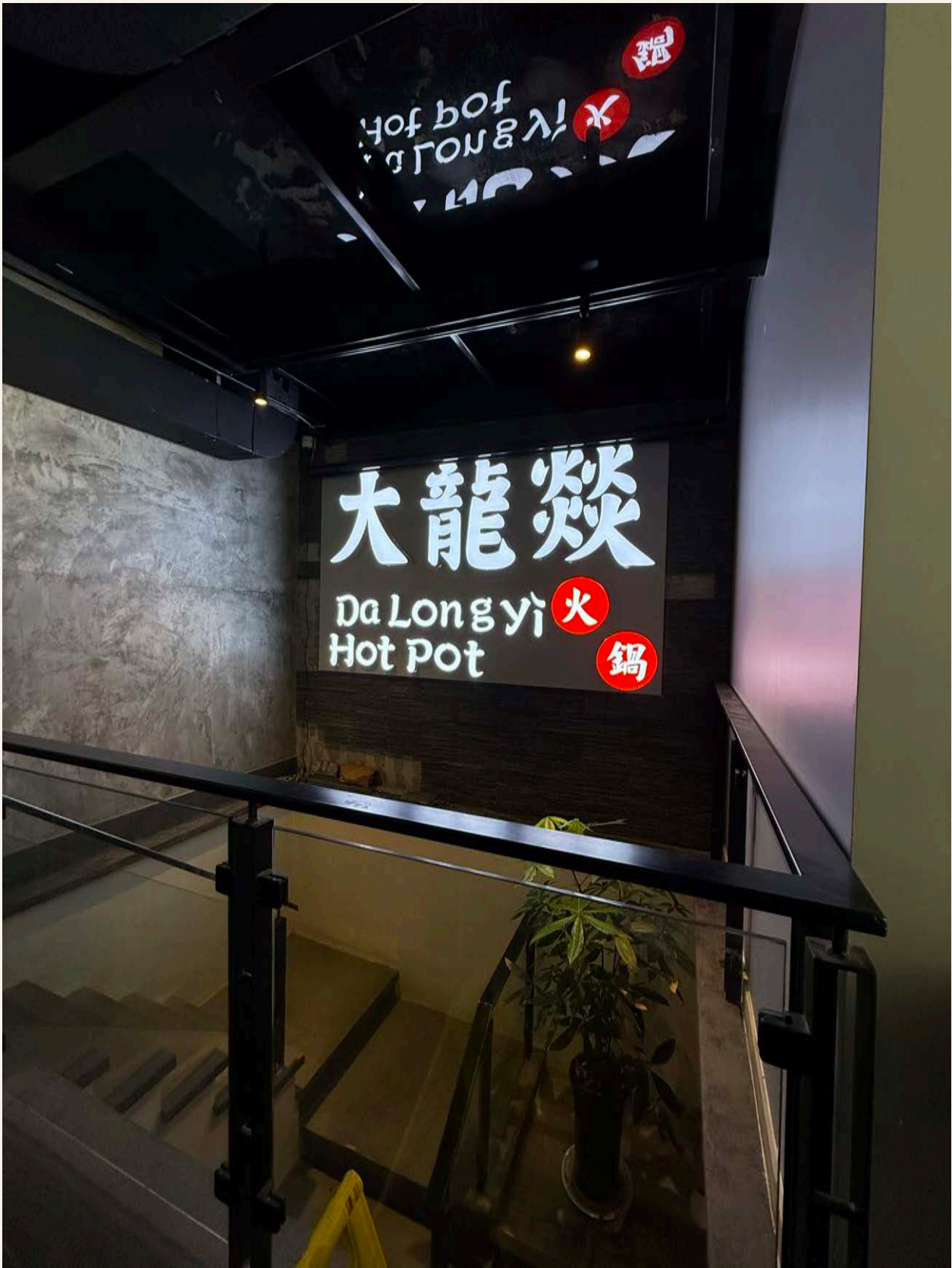
Multi Level Space