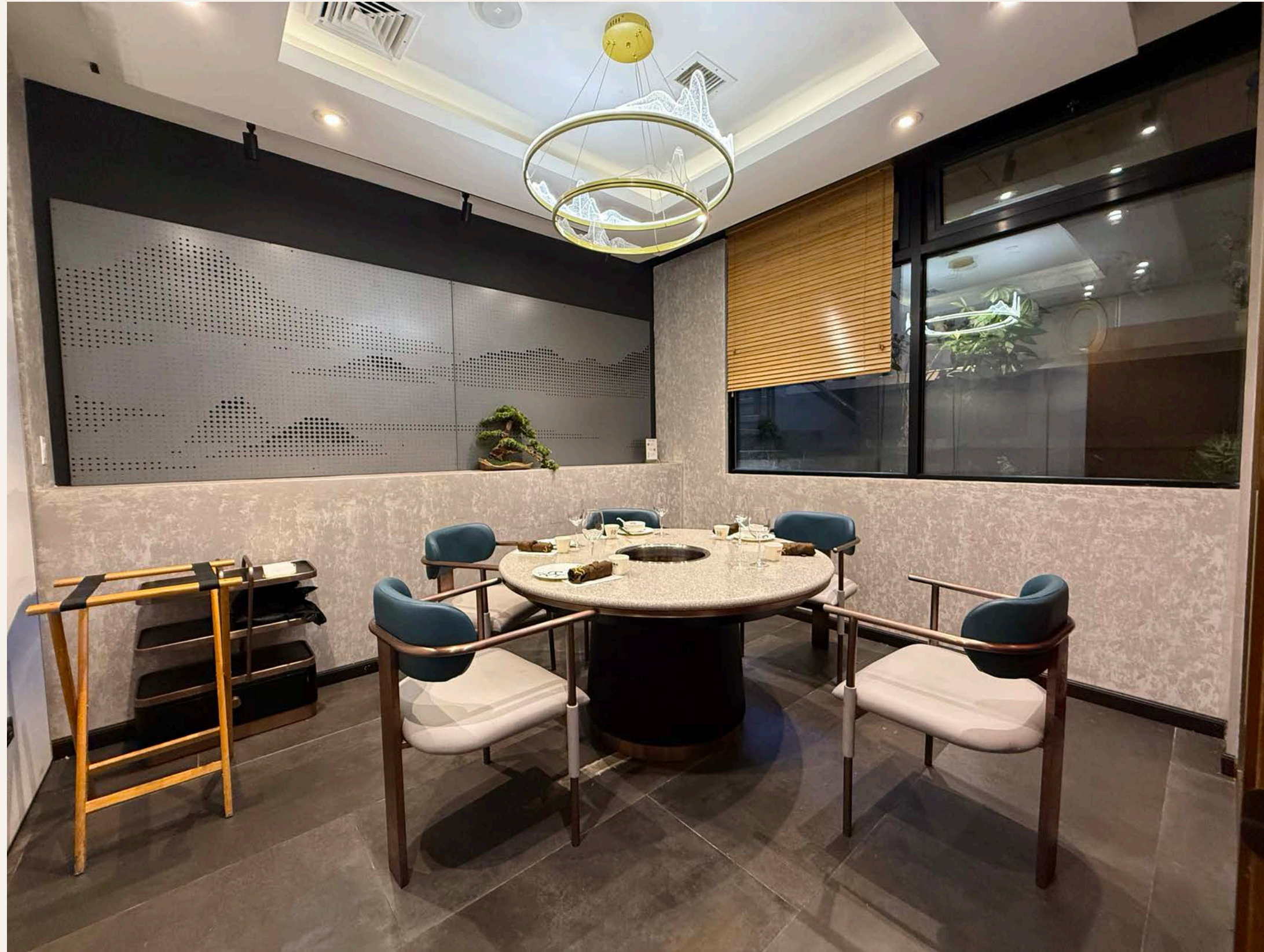
Private Dining Room in lower level