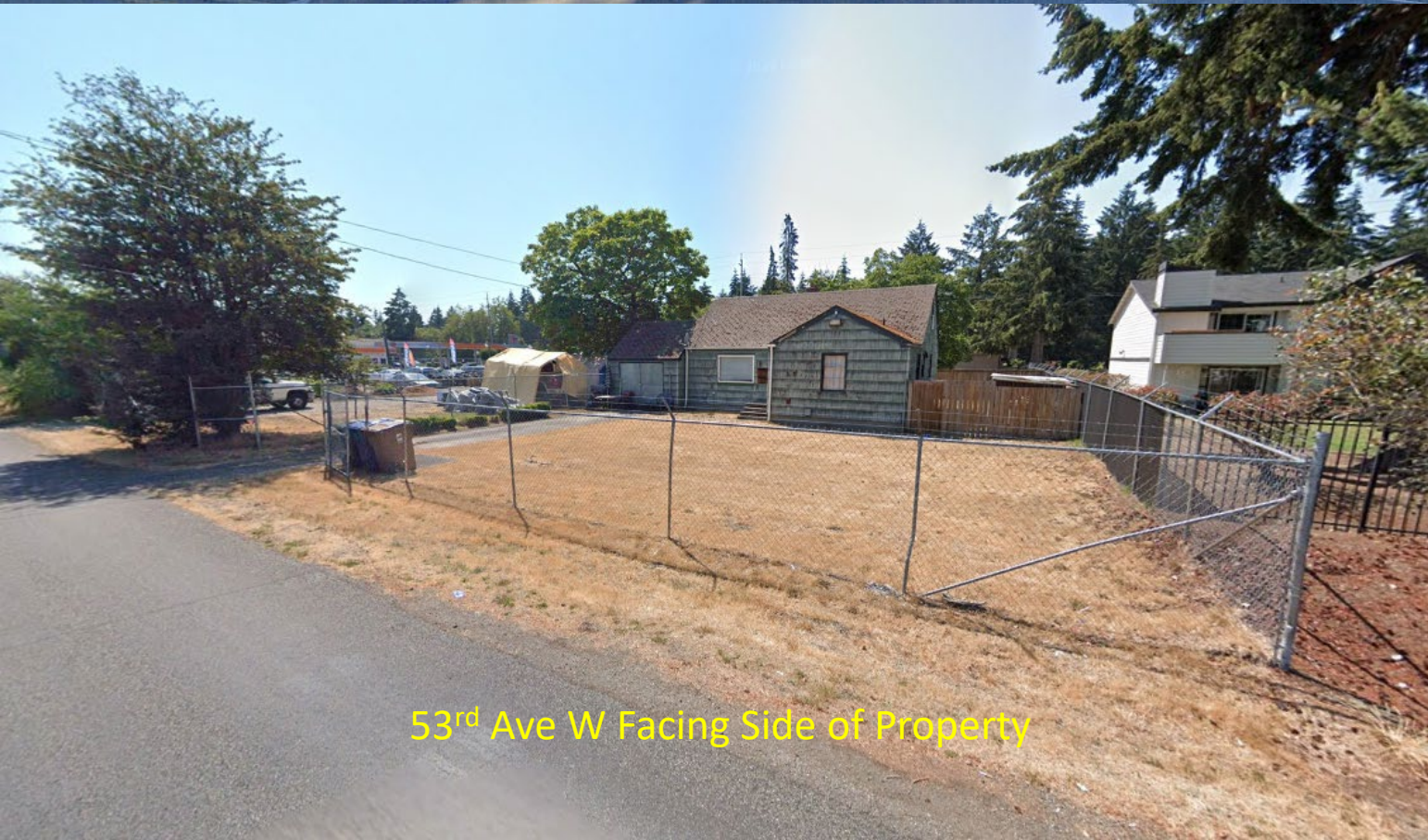
53 rd Ave W Facing Side of Property