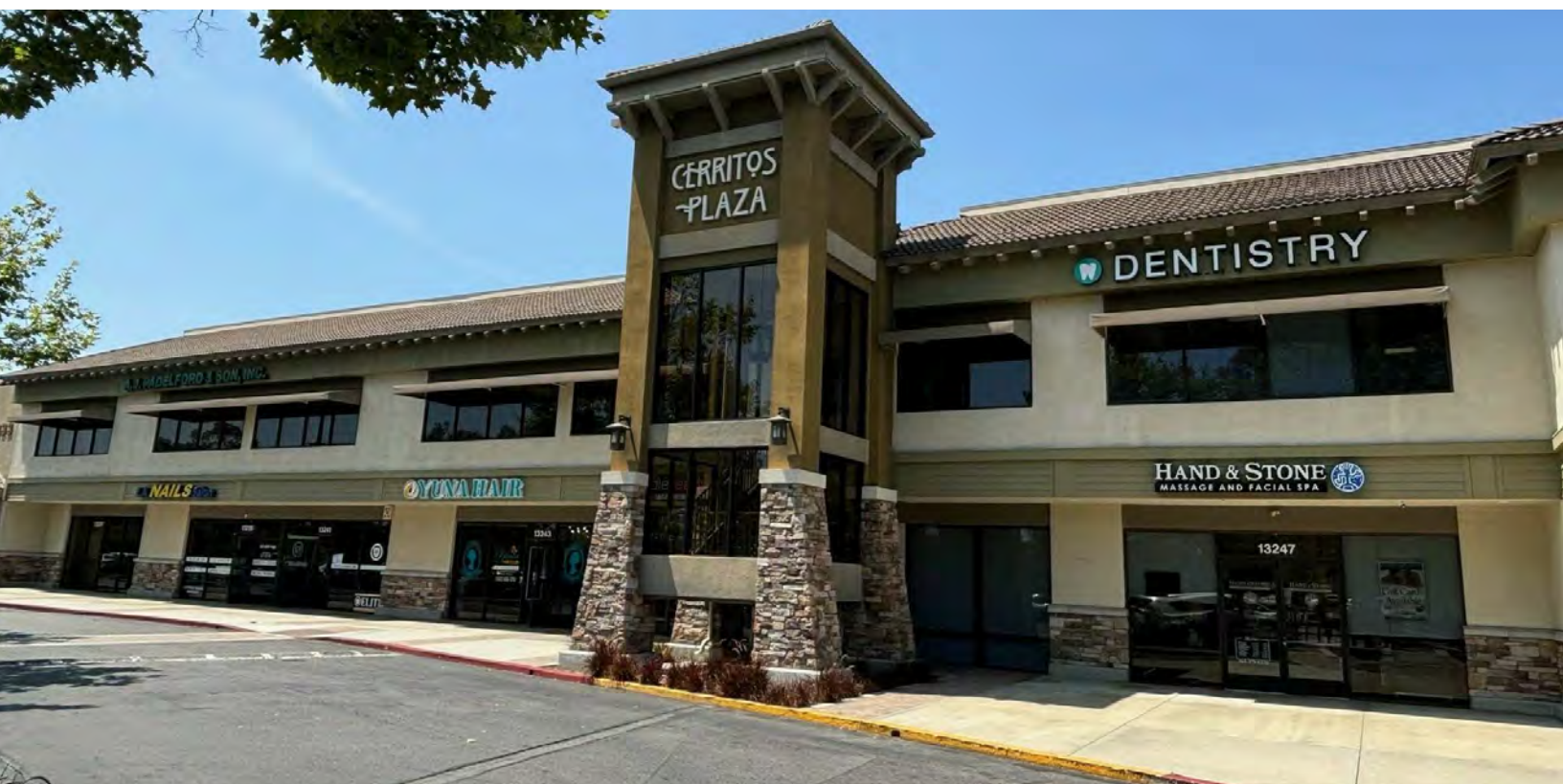
Suite 13273 1,827 SF