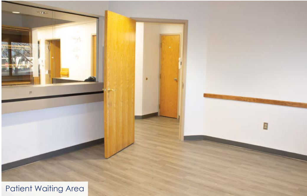
Patient Waiting Area