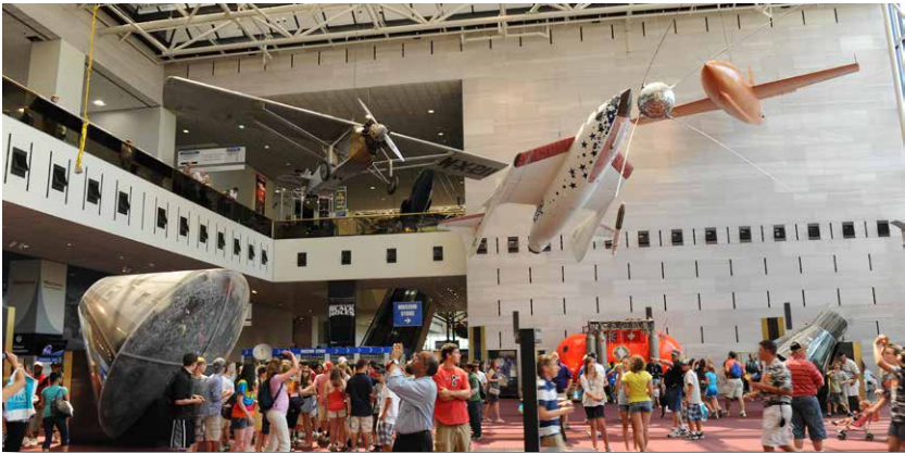
NATIONAL AIR AND SPACE MUSEUM