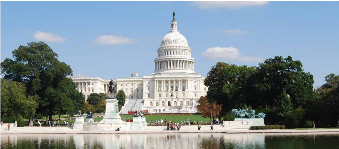
U.S. CAPITOL BUILDING