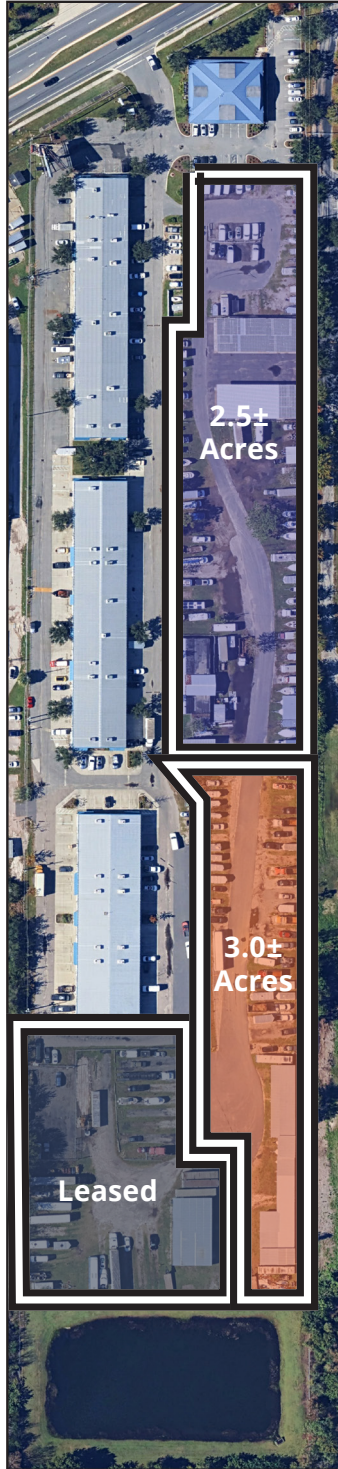
Scenario 2 Two Tenant