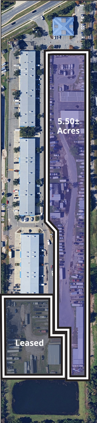
Scenario 1 Single Tenant