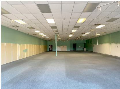
Suite 5026 Interior