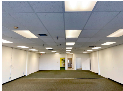
Suite 5132 Interior