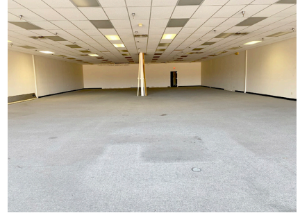
Suite 5010 Interior