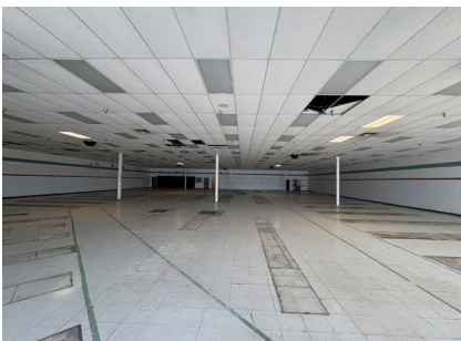
Suite 5034 Interior