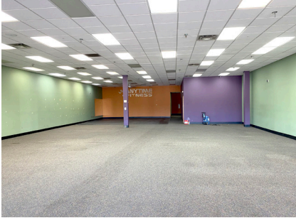
Suite 5000 Interior

4820-5132 SE 14th Street | Des Moines, Iowa