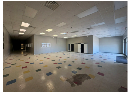
Suite 5040 Interior