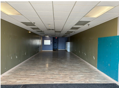
Suite 5116 Interior