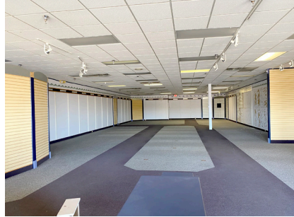
Suite 5004 Interior