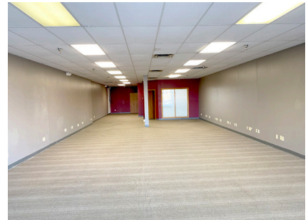
Suite 5128 Interior