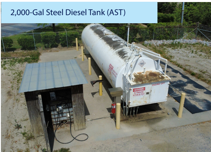
2,000-Gal Steel Diesel Tank (AST)