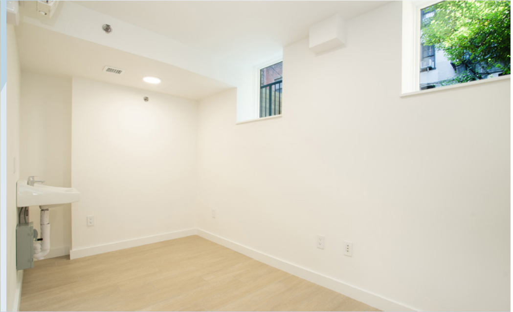
Newly Pre-Built Space