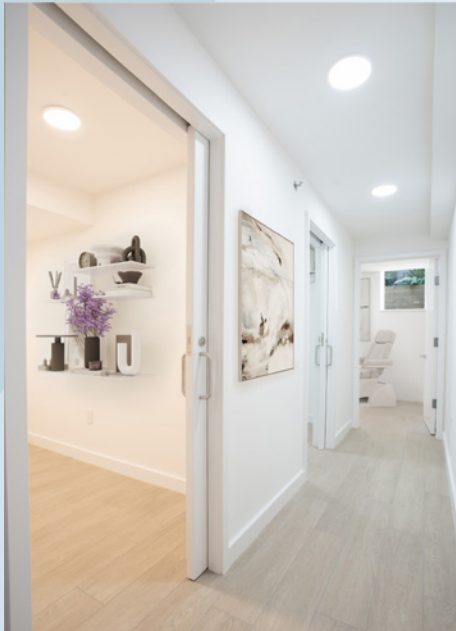
Virtually Staged Hallway for Concept Only