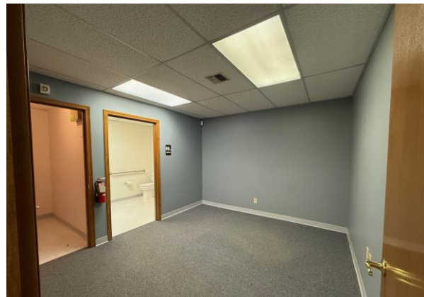
1115 - Suite 208