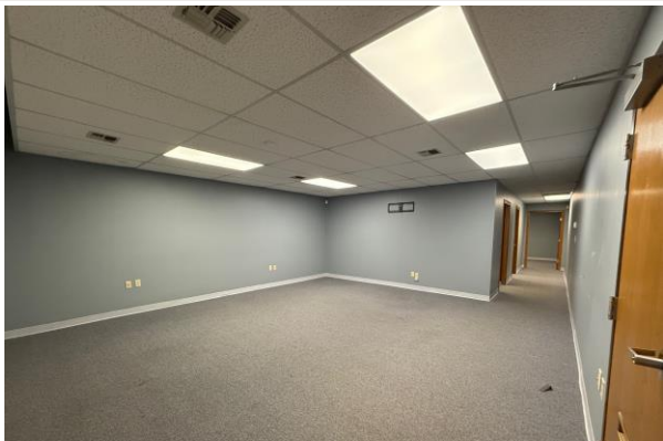
1115 - Suite 208

1107-1115 S. Glendale Ave., Wichita, KS 67218