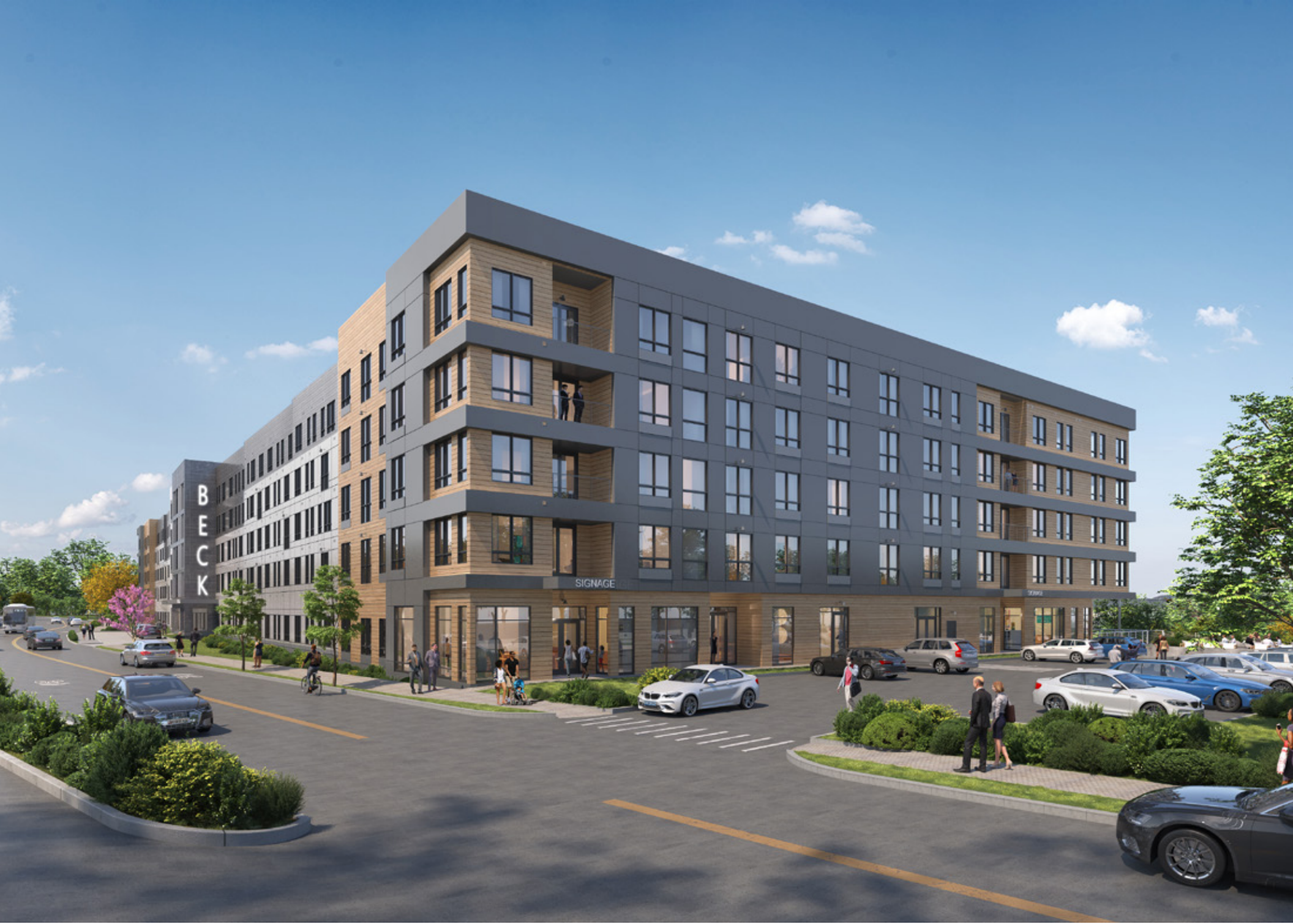
EAST CORNER AND RESTAURANT/CAFE PARKING