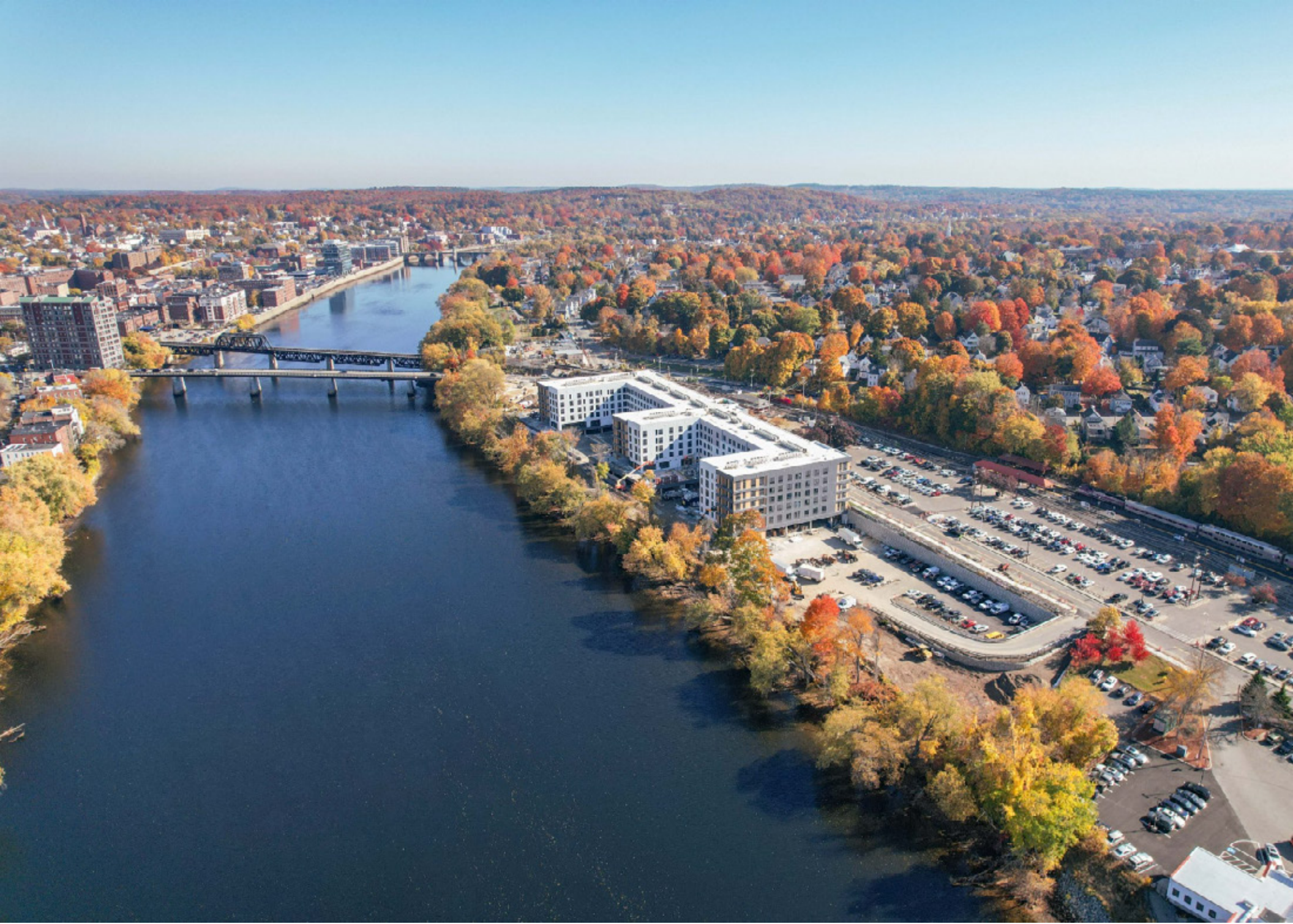
WESTERN OVERHEAD VIEW