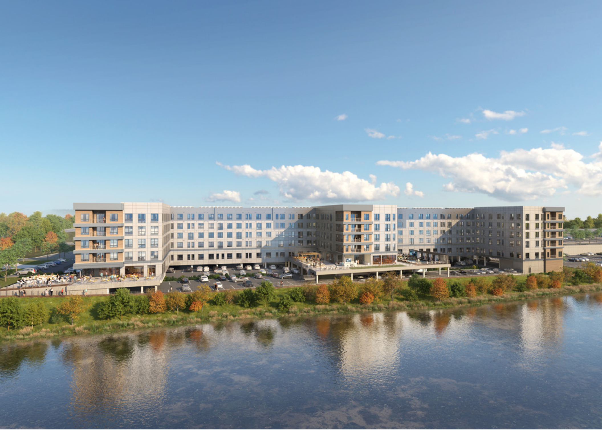
VIEW FROM THE MERRIMACK RIVER