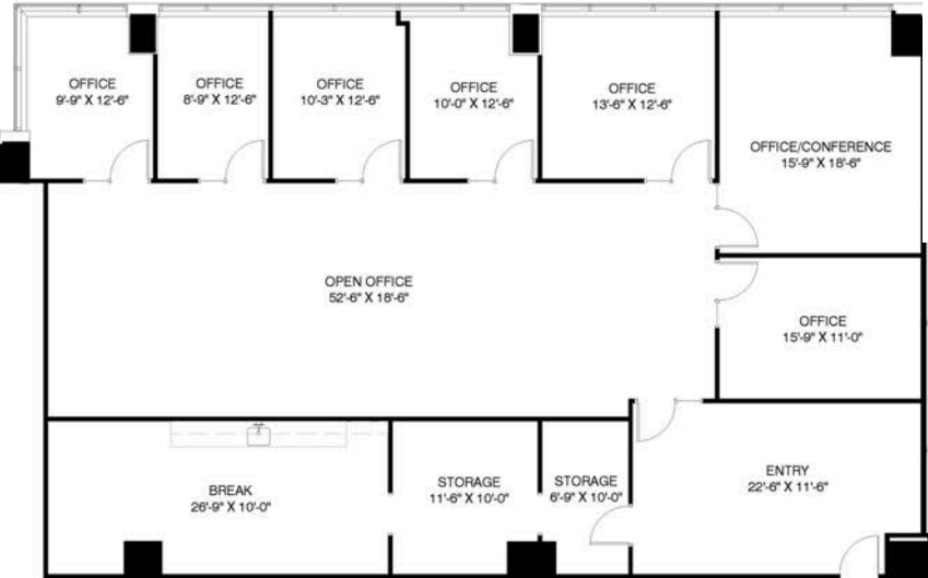
SUITE 350 - 3,589 RSF