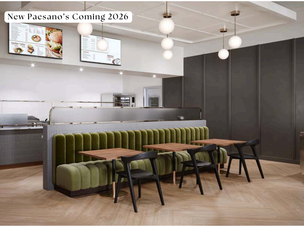
New Paesano's Coming 2026