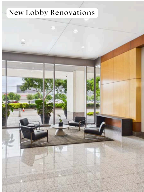
New Lobby Renovations