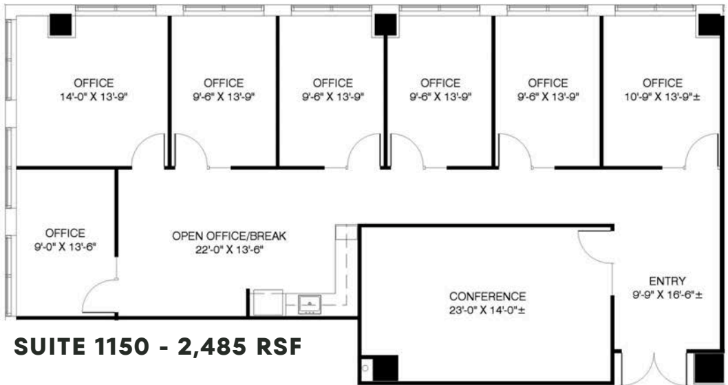
SUITE 1150 - 2,485 RSF