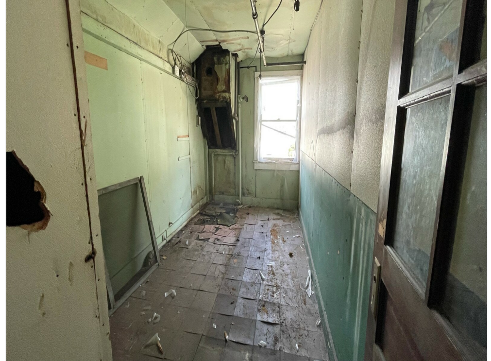
2nd Floor - Side Room