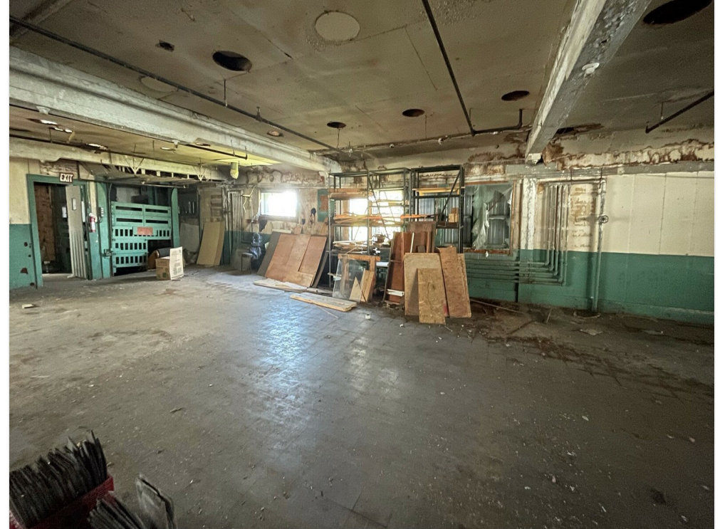
2nd Floor - Main Room