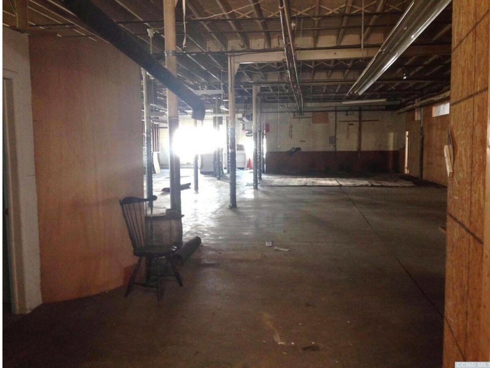
1st Floor - Main Room