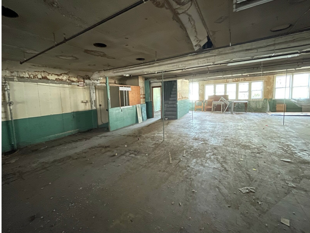
2nd Floor - Main Room