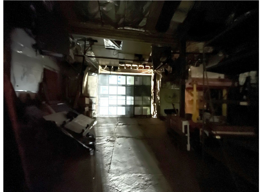
1st Floor - Garage