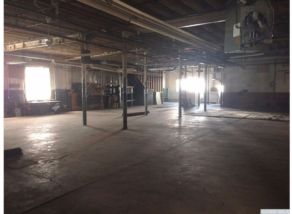
1st Floor - Main Room