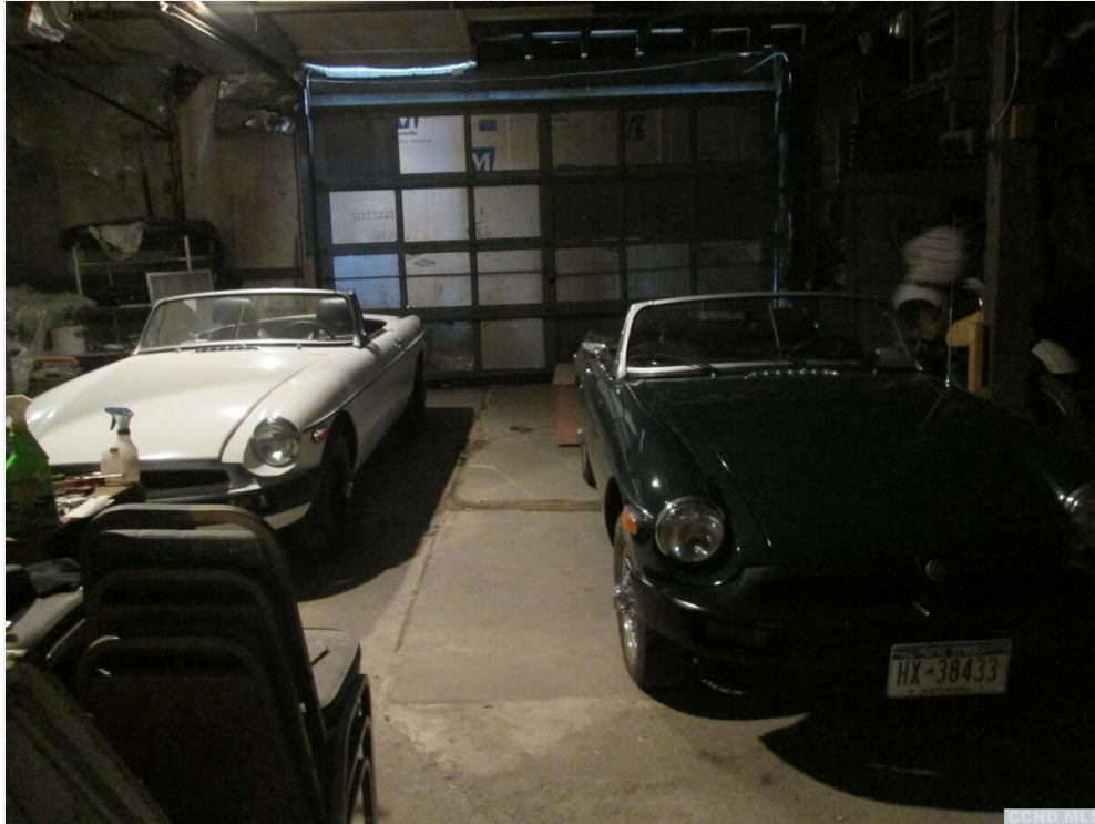
1st Floor - Garage