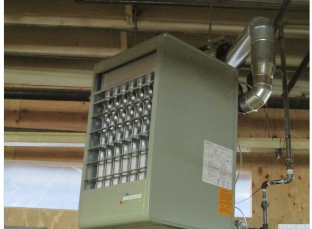
1st Floor - Gas Space Heaters