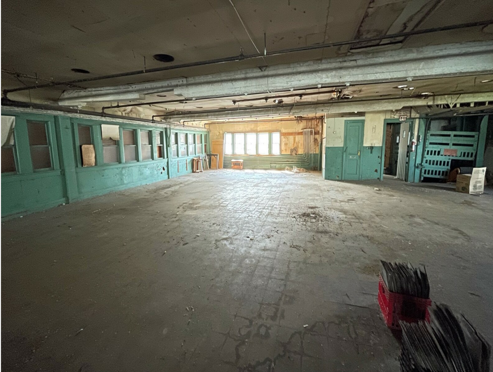
2nd Floor - Main Room