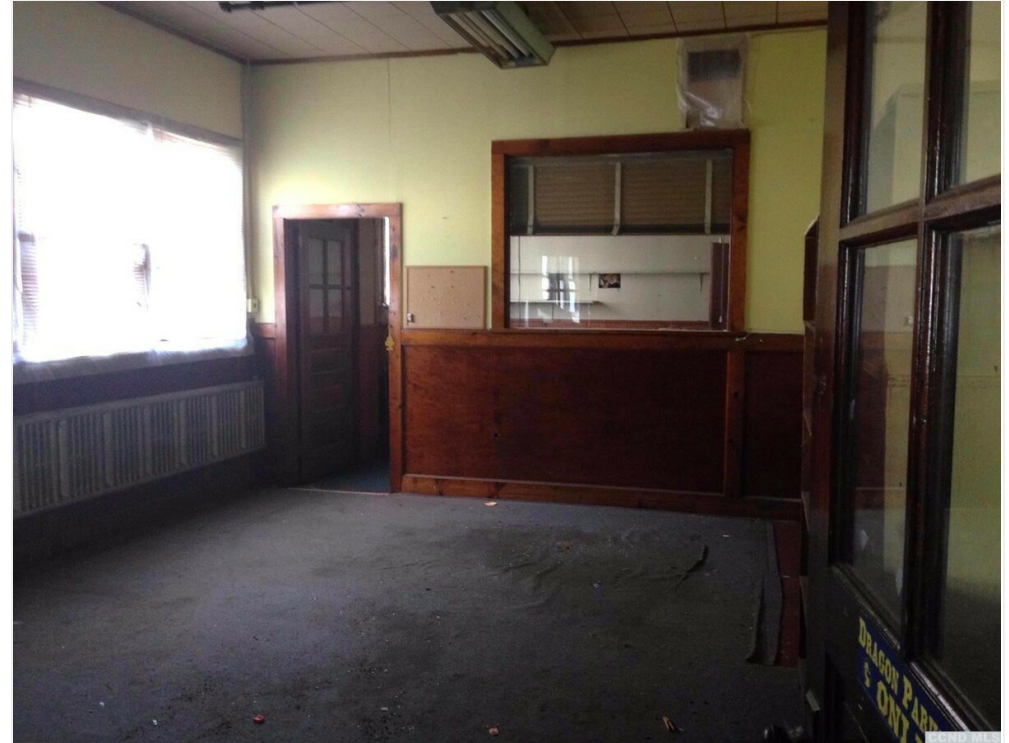
1st Floor - Office