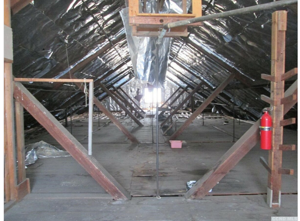
Third Floor - Interior