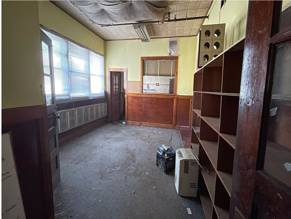
1st Floor - Office