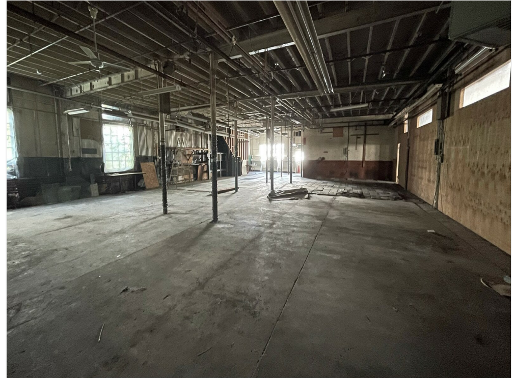
1st Floor - Main Room