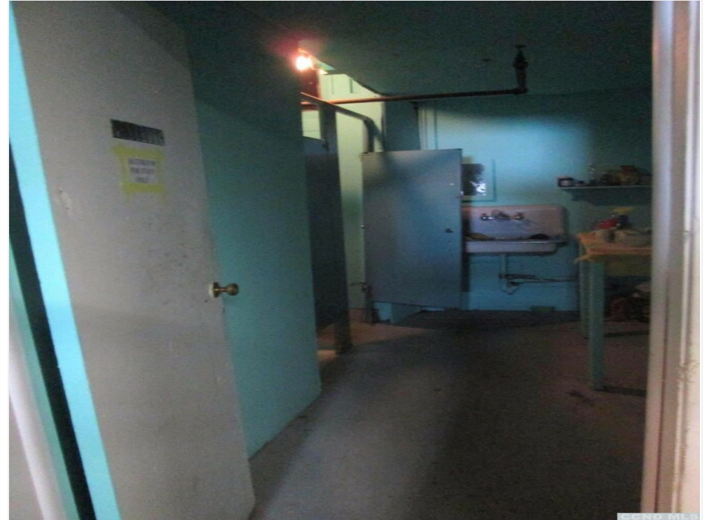
1st Floor - Bathroom