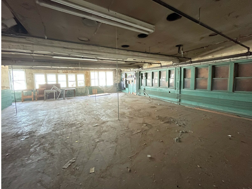
2nd Floor - Main Room