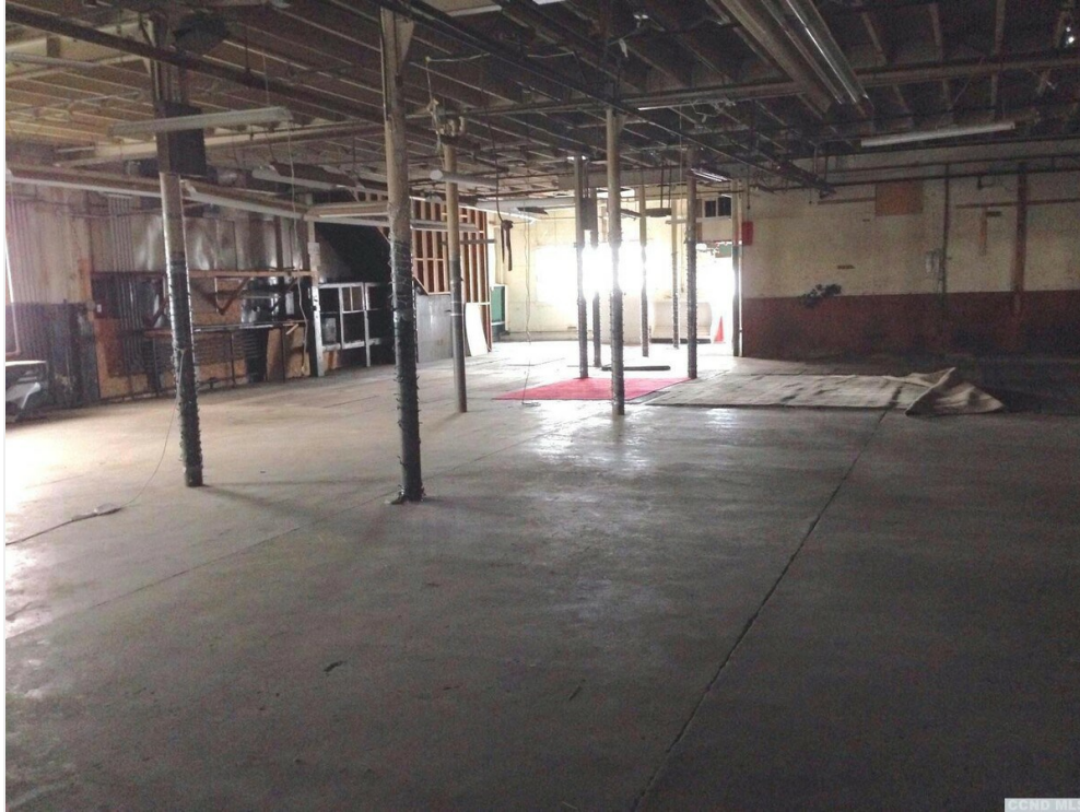
1st Floor - Main Room