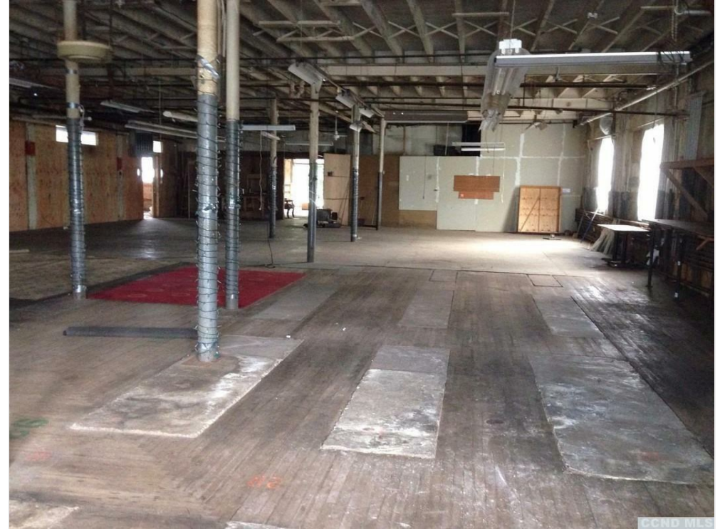
1st Floor - Main Room