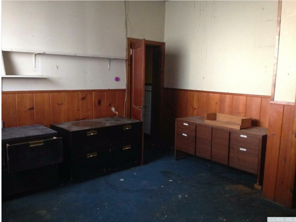
1st Floor - Office