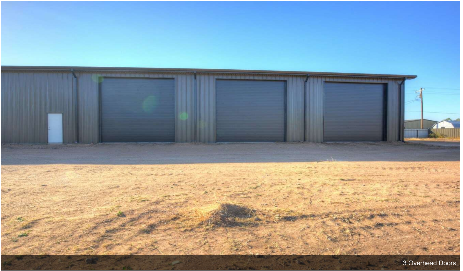
3 Overhead Doors