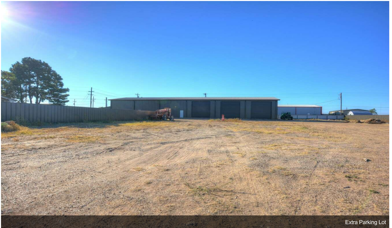
Extra Parking Lot