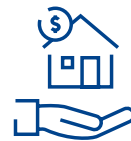
Average Household Income