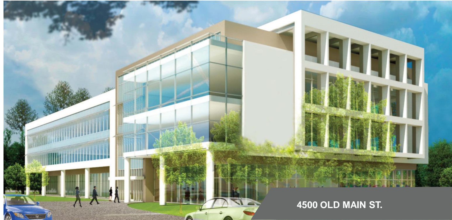
4500 OLD MAIN ST.