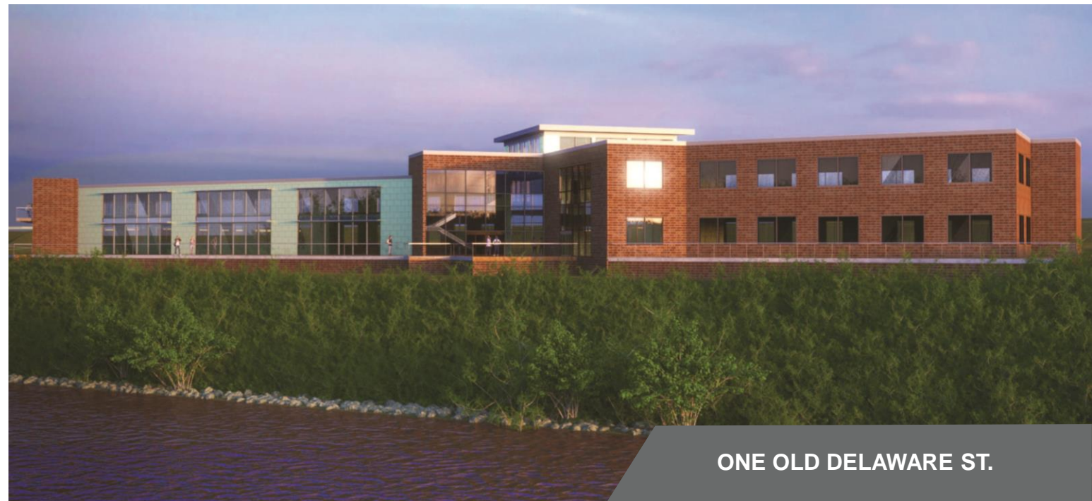
ONE OLD DELAWARE ST.