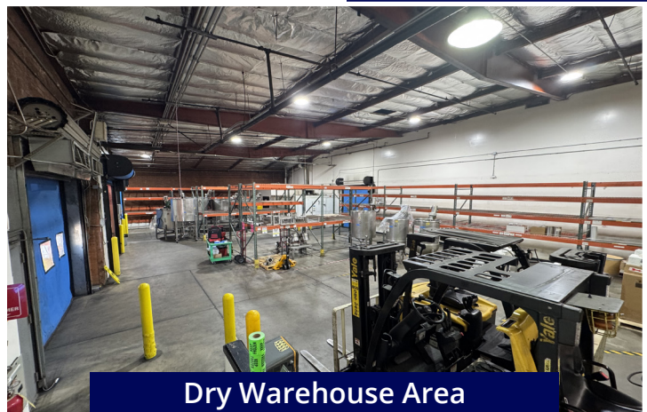
Dry Warehouse Area