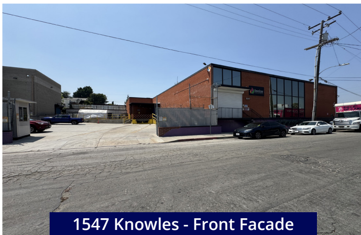
1547 Knowles - Front Facade