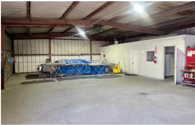
Interior of warehouse / shop