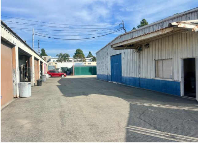
Flexible metal buildings