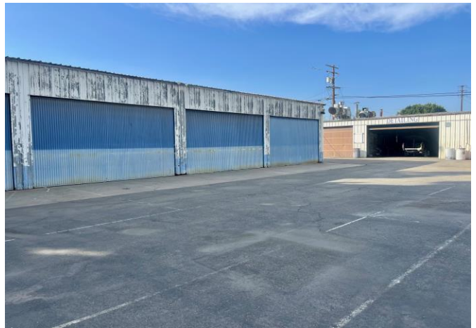
Oversized loading doors and parking / yard area