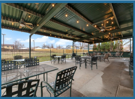
Covered Patio Seats 80