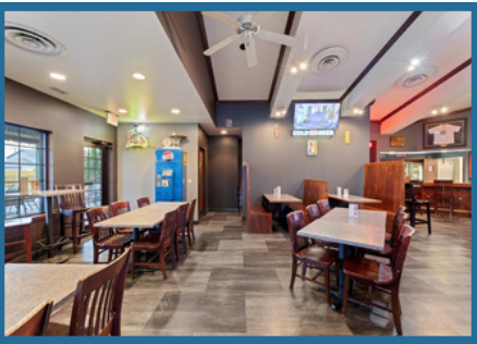
Dining Room Seats 80