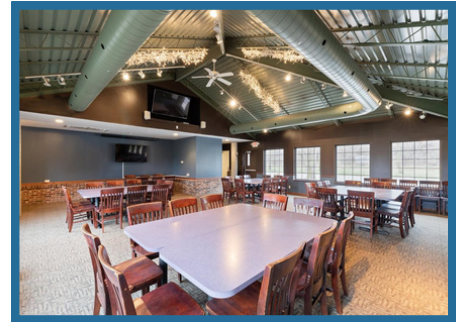
Banquet Room Seats 70