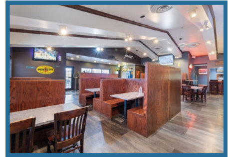
Private Booths & Bar Area