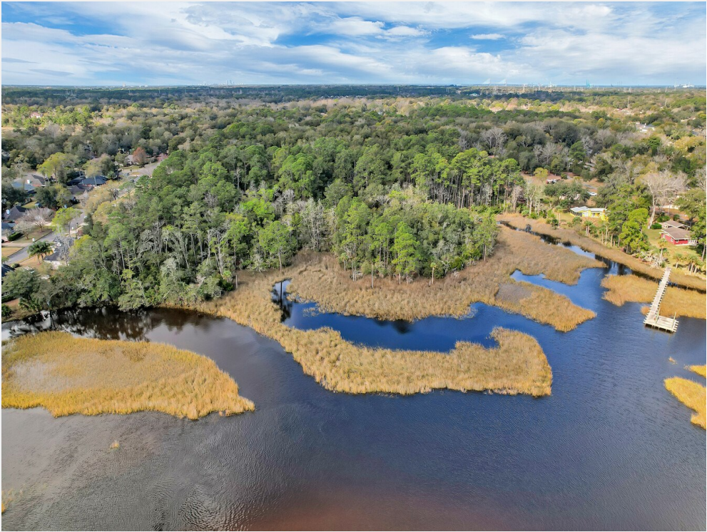
Quinlan Aerial 5