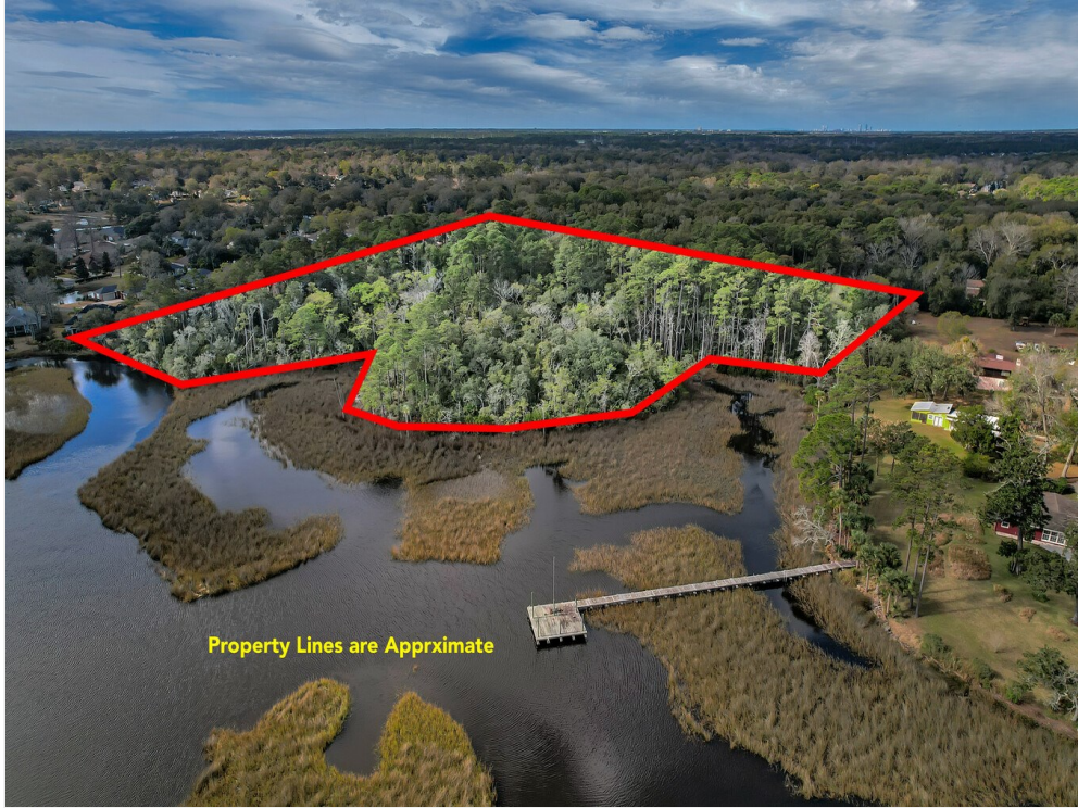
Quinlan Property Line 3