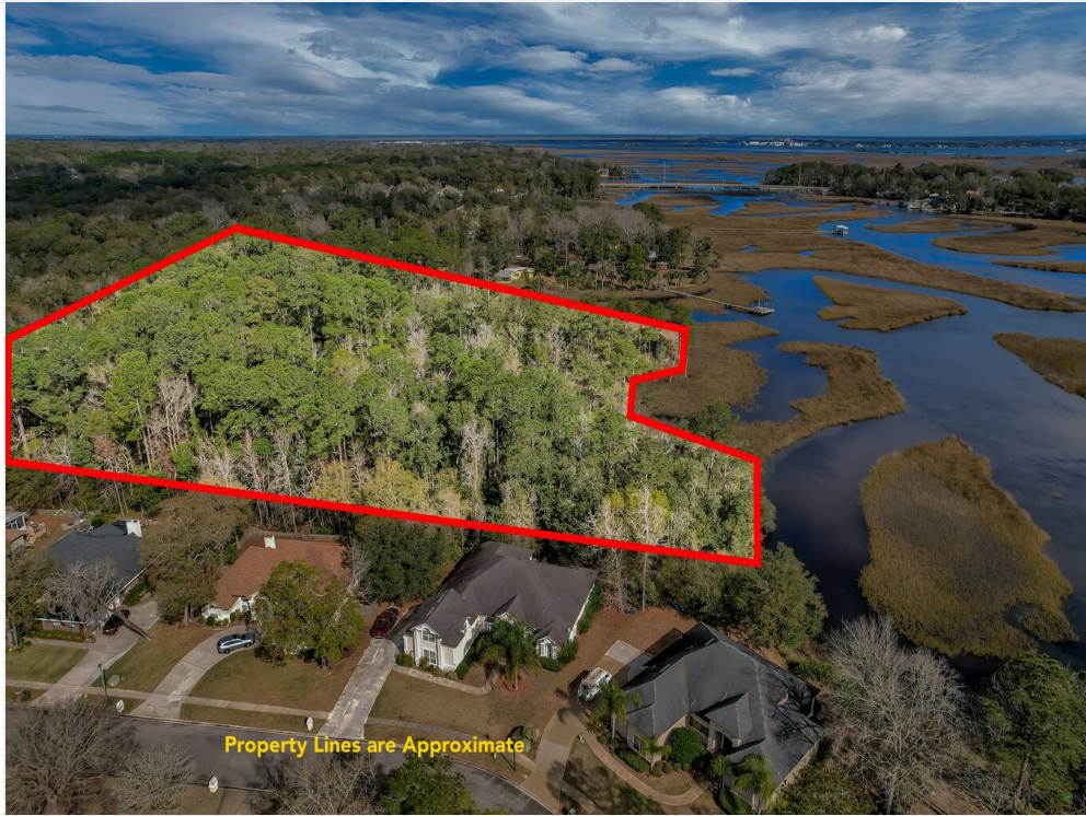
Quinlan Property Line 2