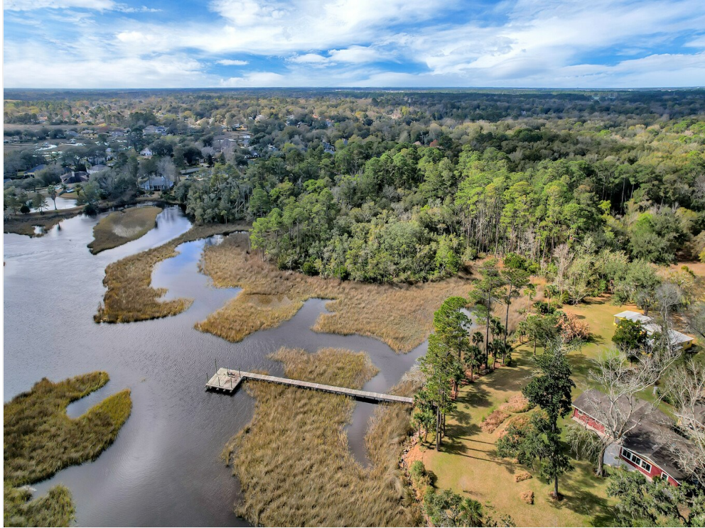
Quinlan Aerial 1A