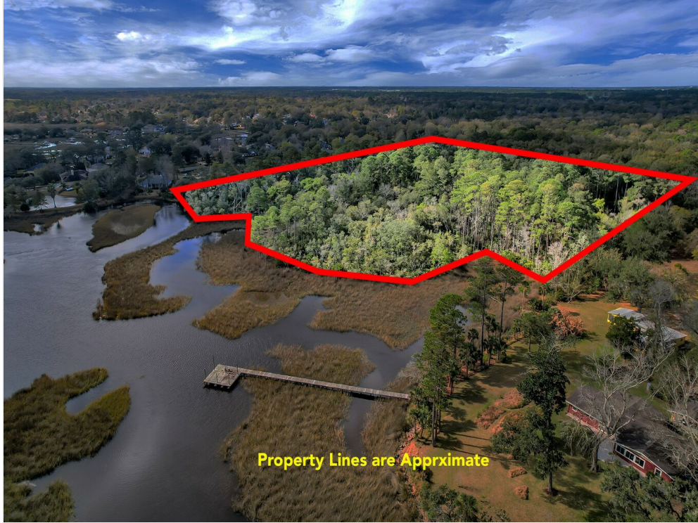
Quinlan Property Line 4