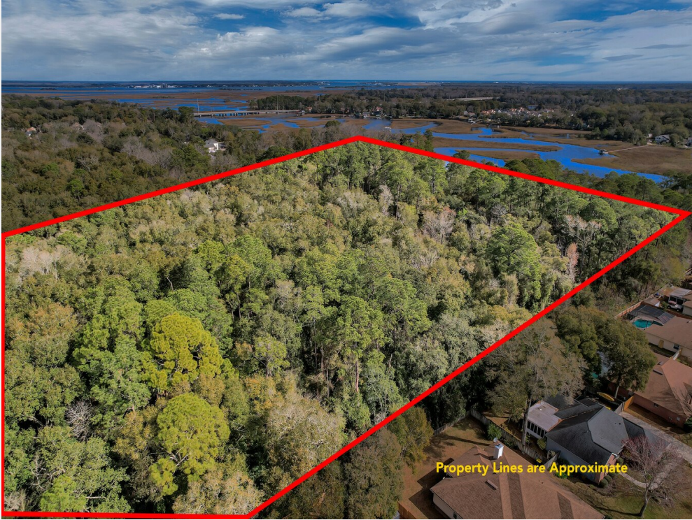
Quinlan Property Line 1