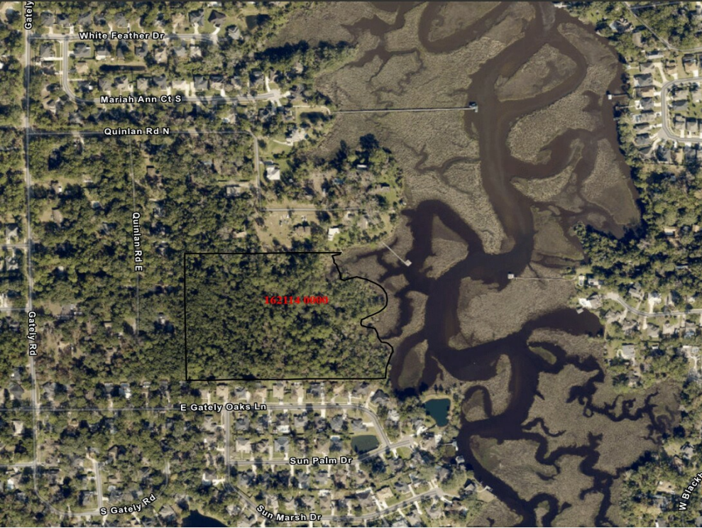
Quinlan Ridge Aerial