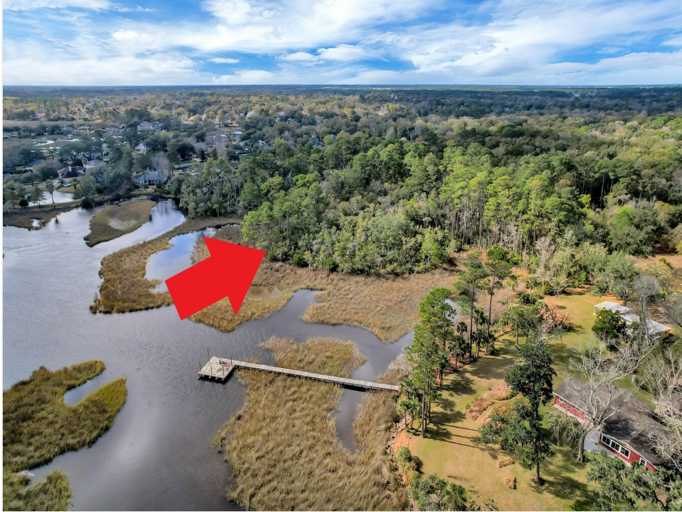
Quinlan Aerial 1B