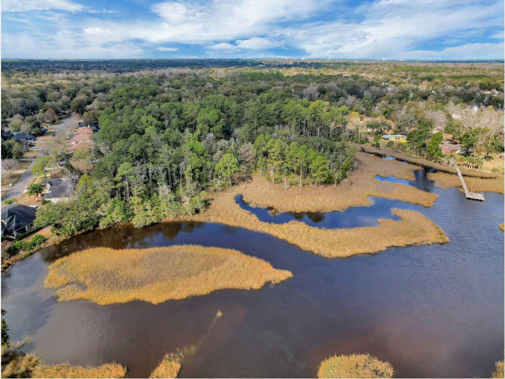
Quinlan Aerial 2