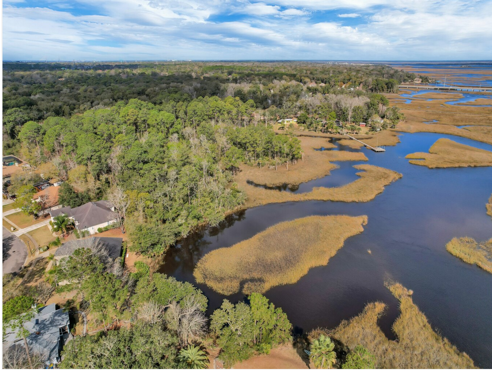
Quinlan Aerial 3