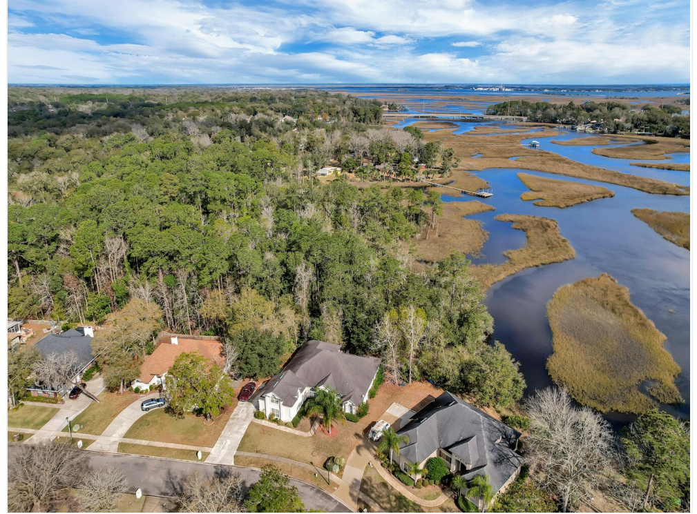
Quinlan Aerial 4