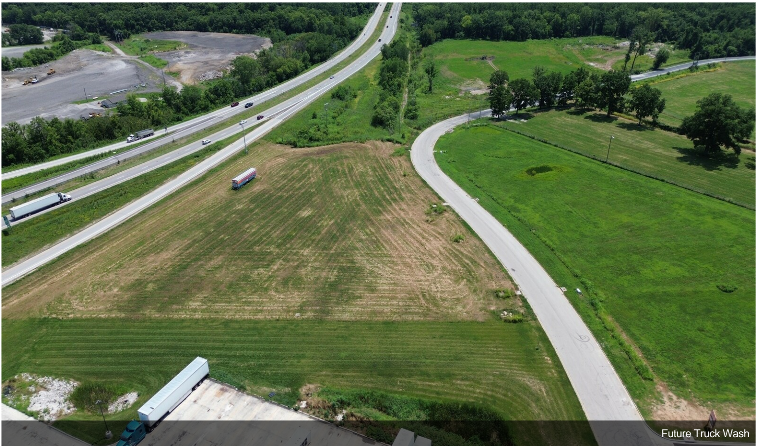
Future Truck Wash