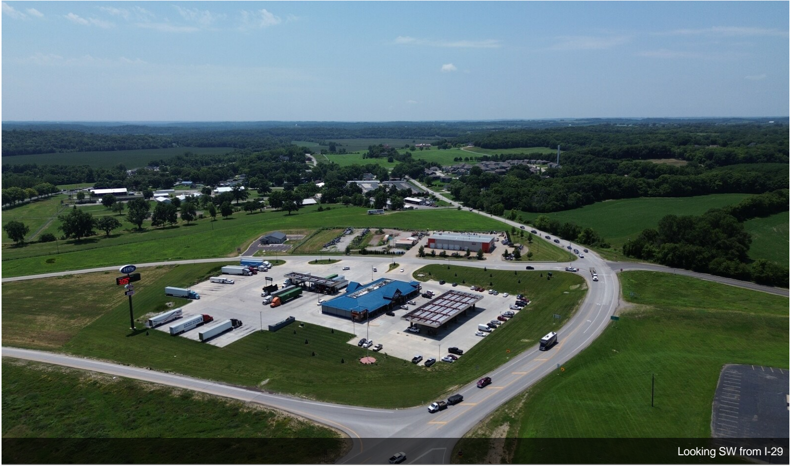
Looking SW from I-29