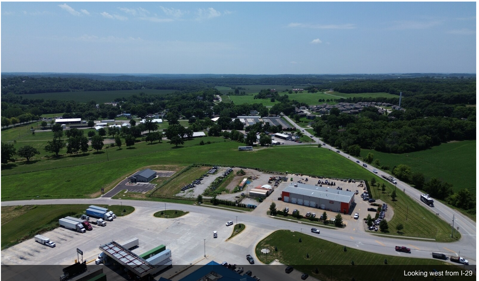
Looking west from I-29