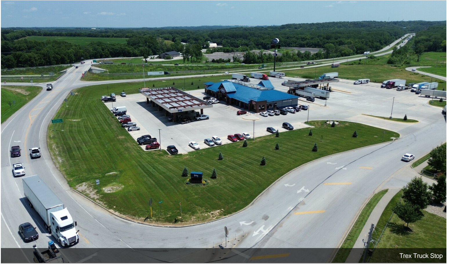
Trex Truck Stop