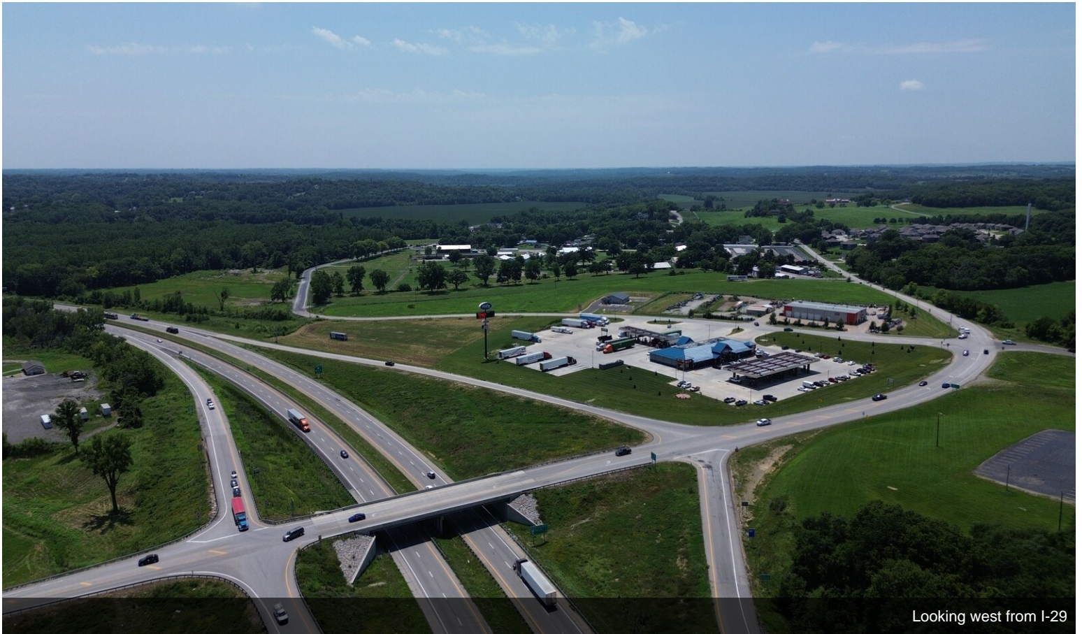
Looking west from I-29