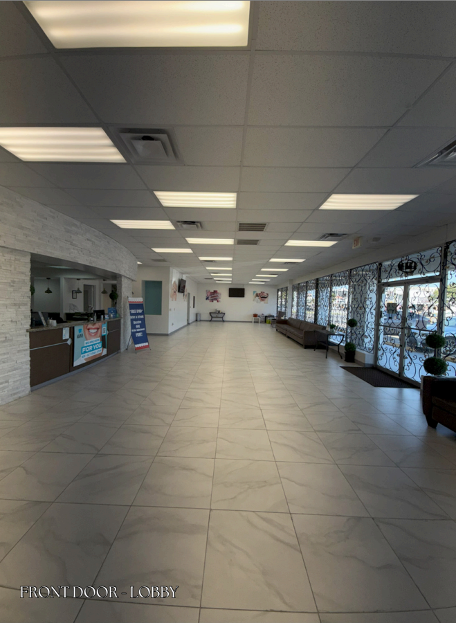
FRONT DOOR - LOBBY