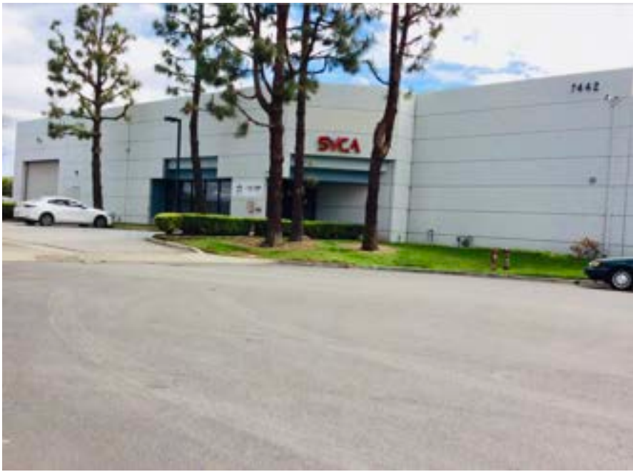
Front Door Handicap Parking.