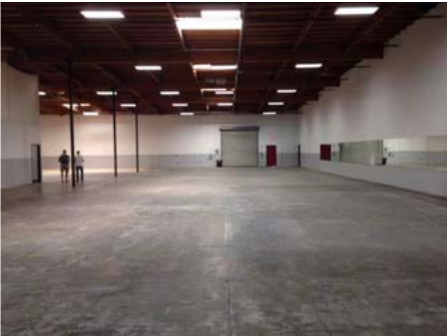
Large east/ west gym sporting or church assembly area.