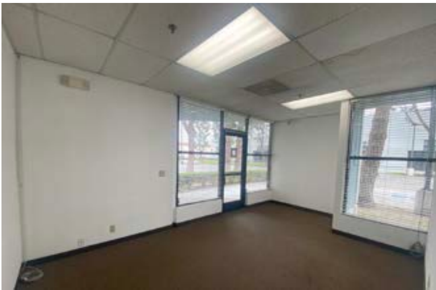
Entrance lobby including guest pick up waiting area.