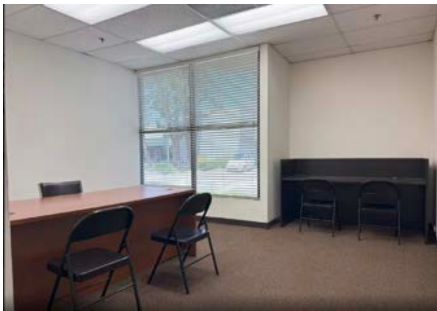
Chief executive officer (CEO) quiet corner office.