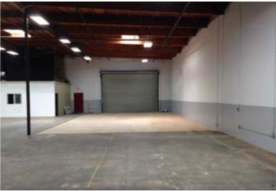
Large north/south gym sporting or church assembly area.