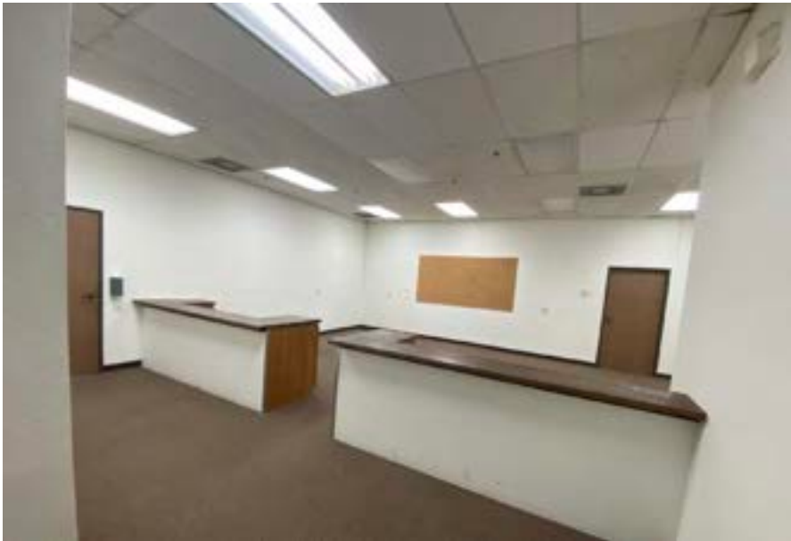
Pro shop with two guest check in counters with souvenir and clothing area, behind security gate.