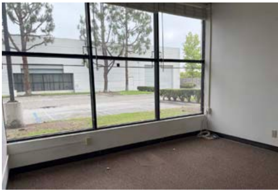
Managers office adjacent to lobby.