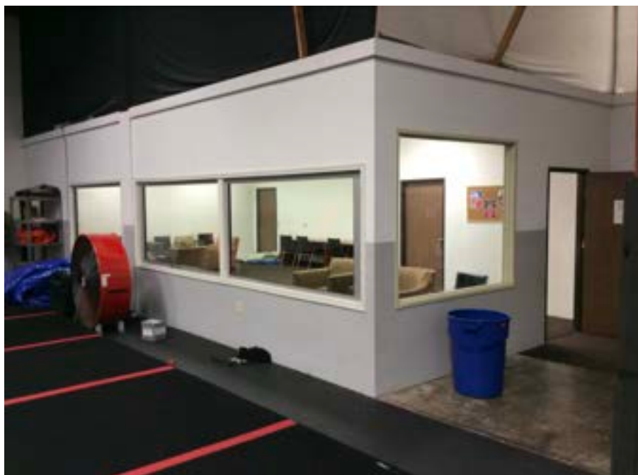
Large sound proof and air conditioned guest viewing room.