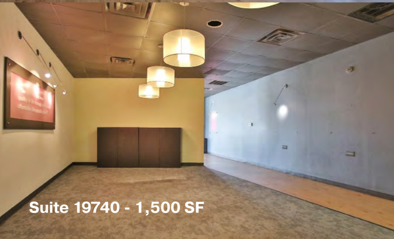
Suite 19740 - 1,500 SF