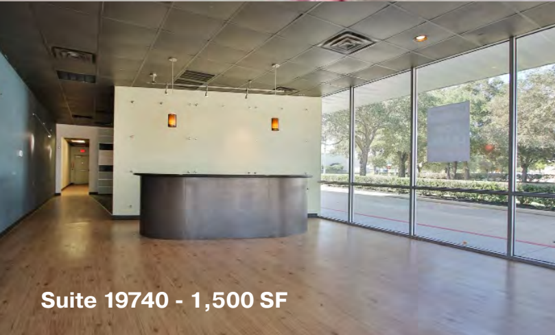
Suite 19740 - 1,500 SF