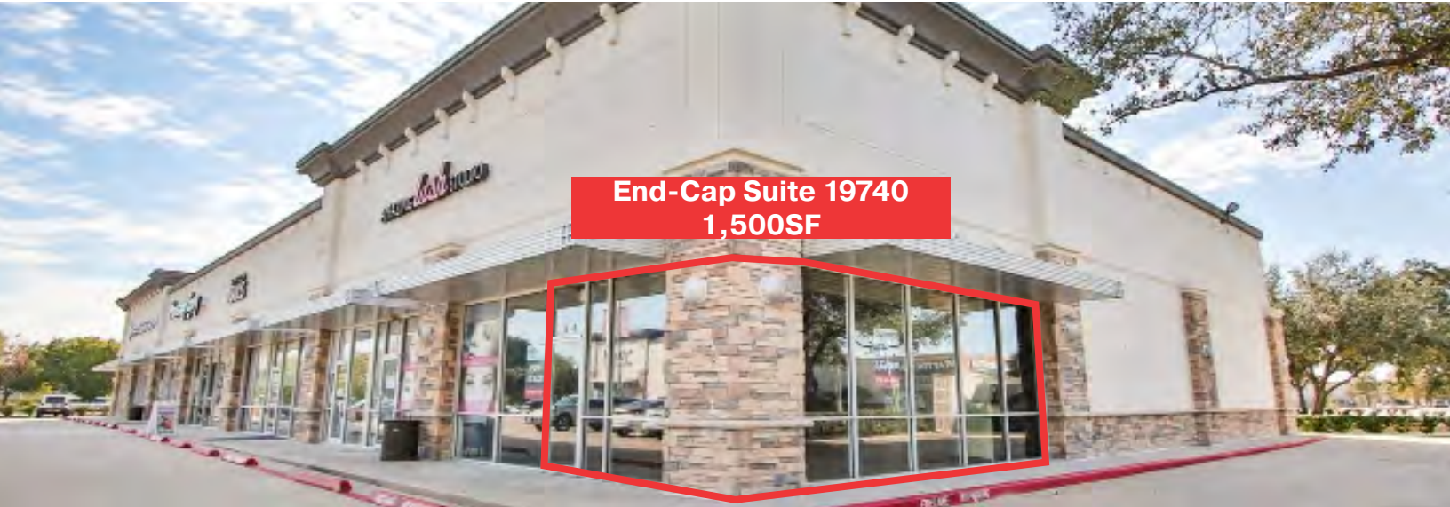
End-Cap Suite 19740 1,500SF