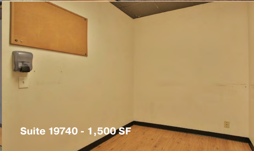
Suite 19740 - 1,500 SF