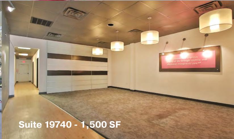
Suite 19740 - 1,500 SF