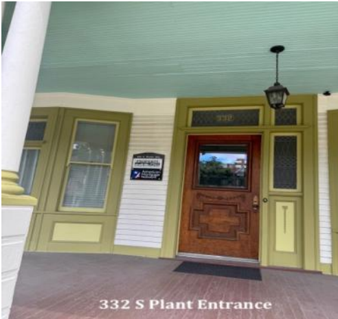
332 S Plant Entrance