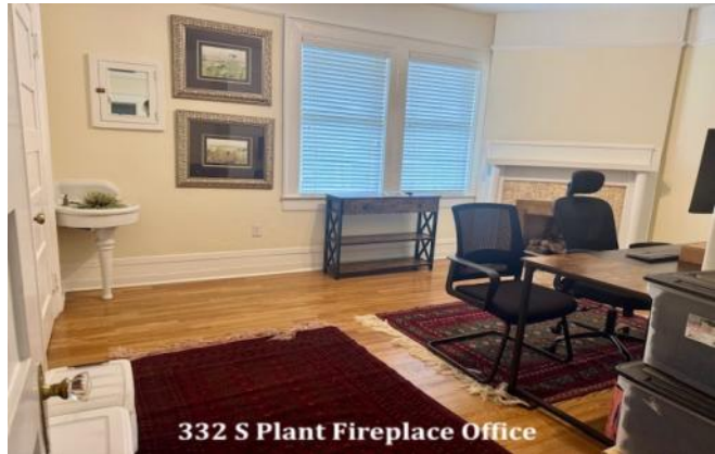
332 S Plant Fireplace Office