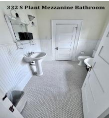
332 S Plant Mezzanine Bathroom