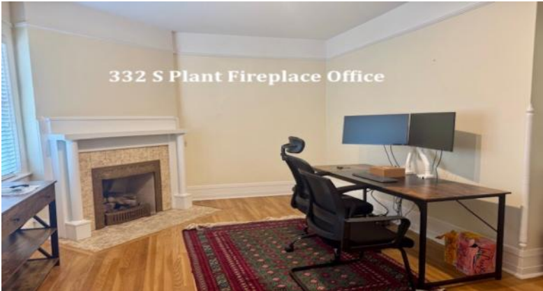
332 S Plant Fireplace Office