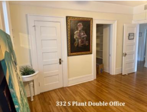
332 S Plant Double Office