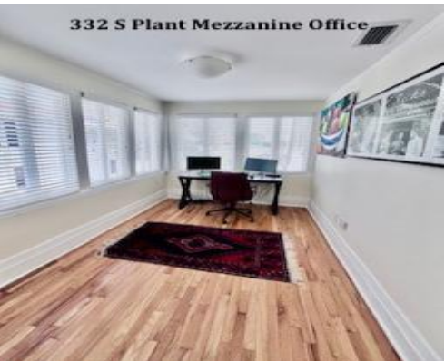
332 S Plant Mezzanine Office