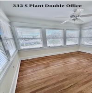
332 S Plant Double Office