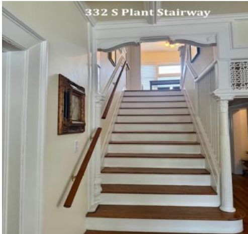
332 S Plant Stairway