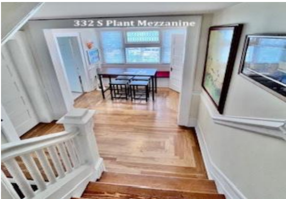
332 S Plant Mezzanine