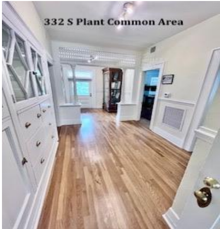
332 S Plant Common Area