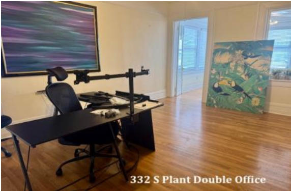
332 S Plant Double Office