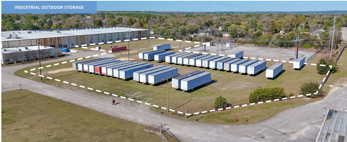
INDUSTRIAL OUTDOOR STORAGE

SHAKESPEARE. Solutions are in the Science