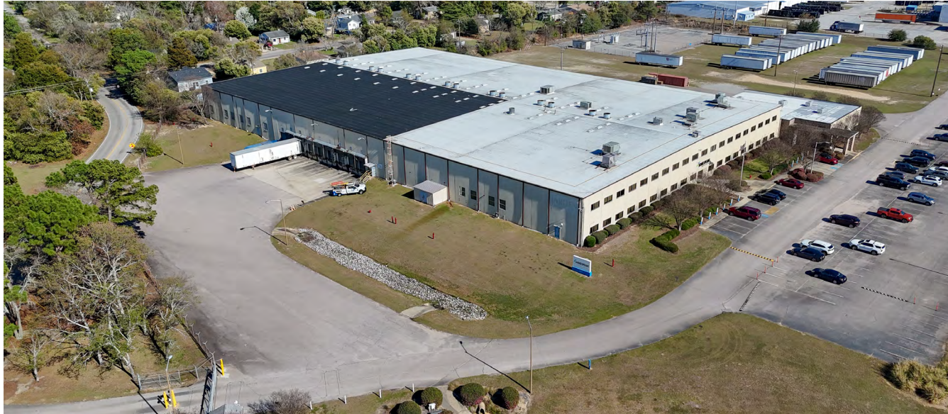
WELL-MAINTAINED LOADING DOORS