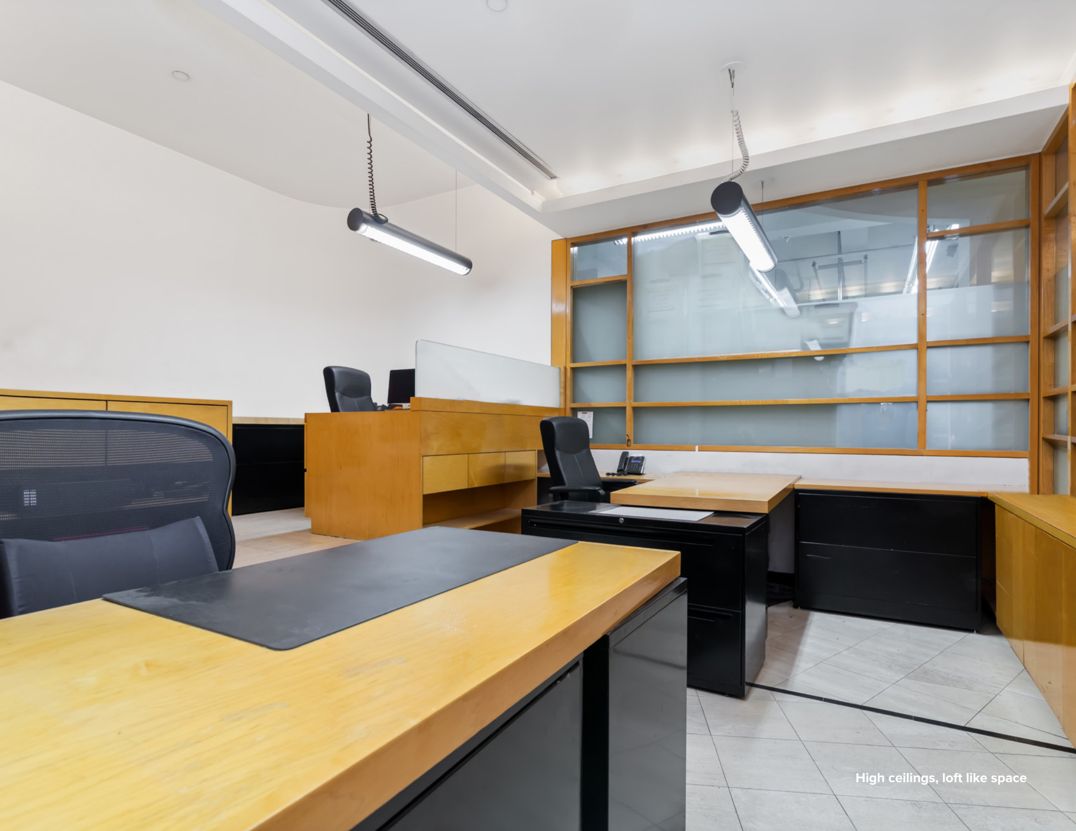
High ceilings, loft like space