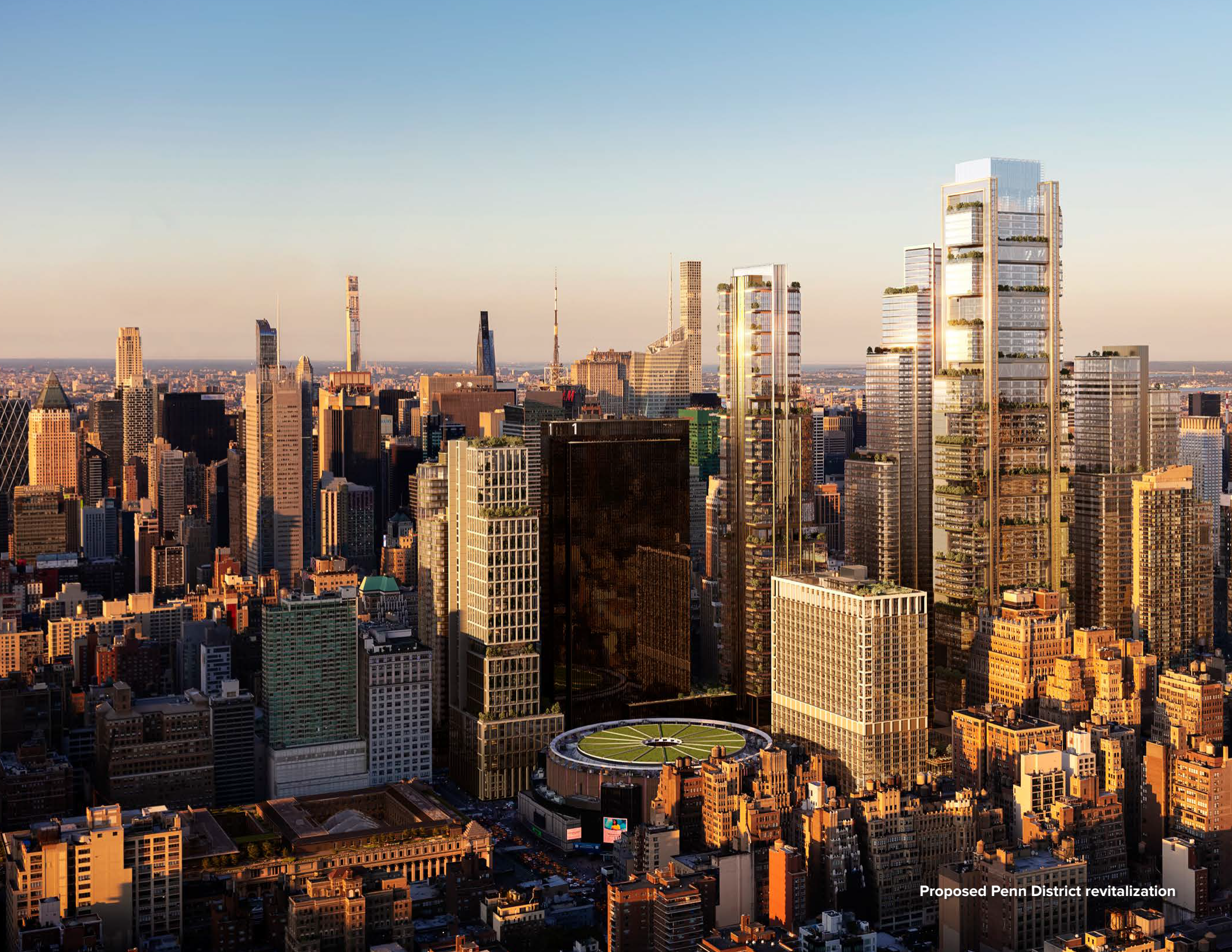
Proposed Penn District revitalization