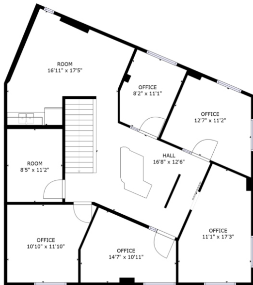
FLOOR 3 - 1311 SQ FT