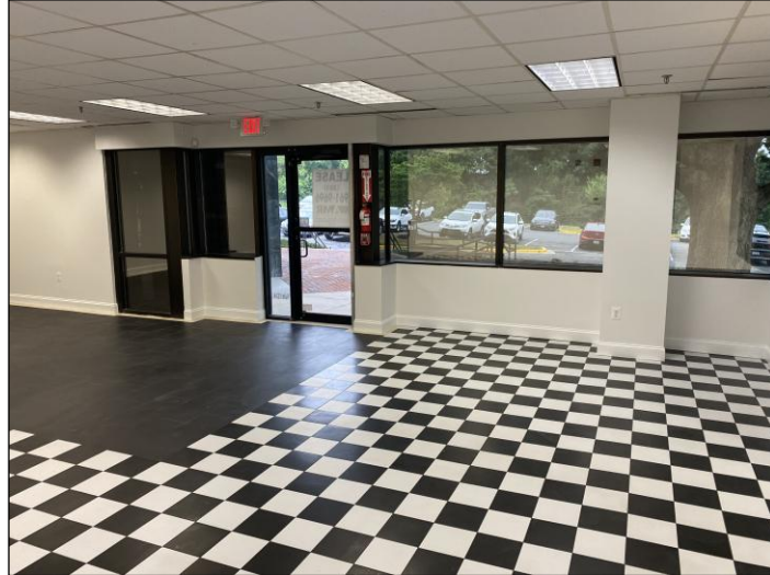
Direct Exterior Entrance