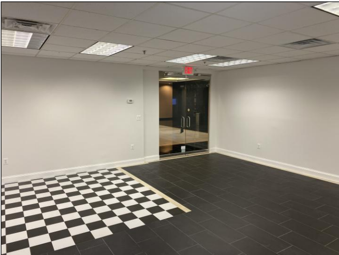
Interior Lobby Entrance