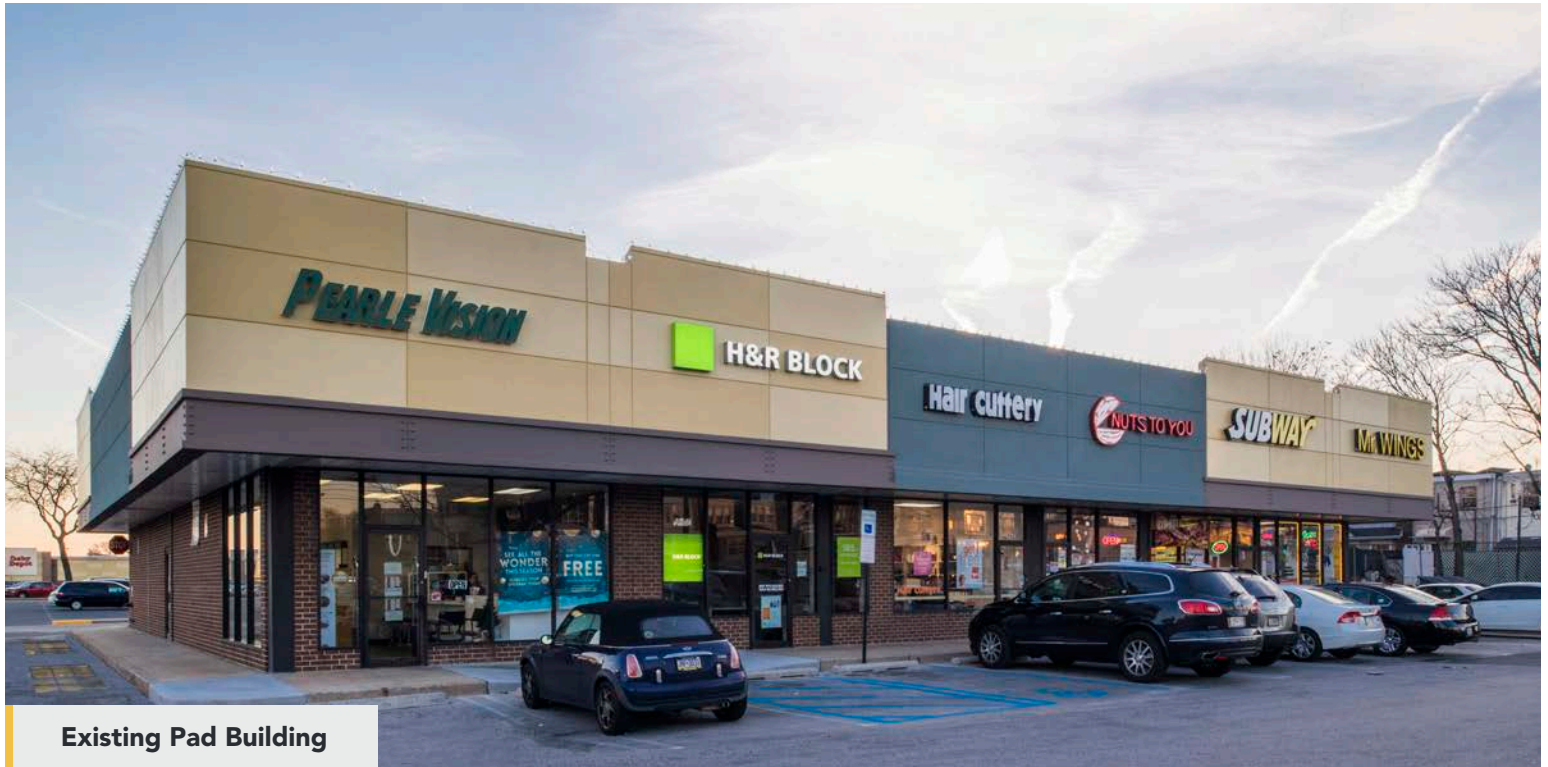
Existing Pad Building