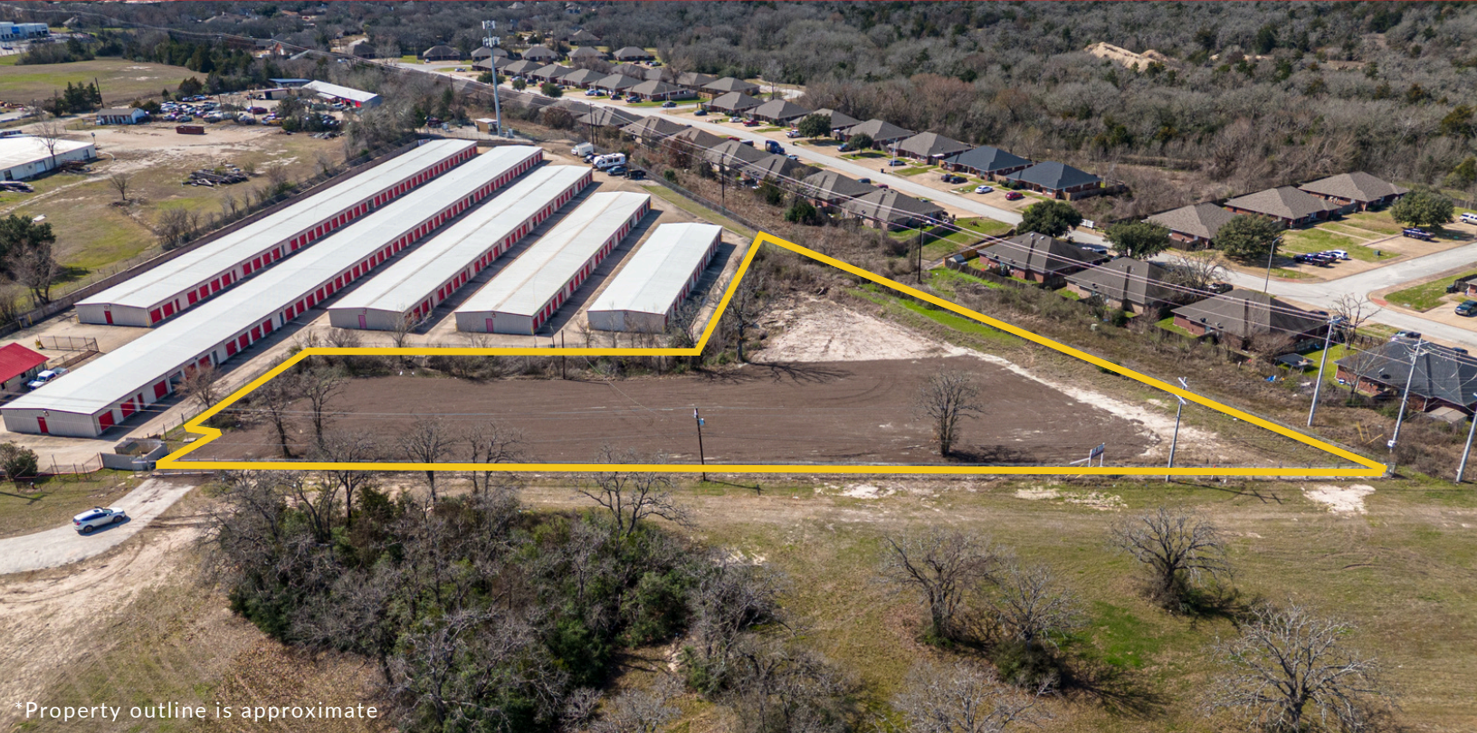
*Property outline is approximate