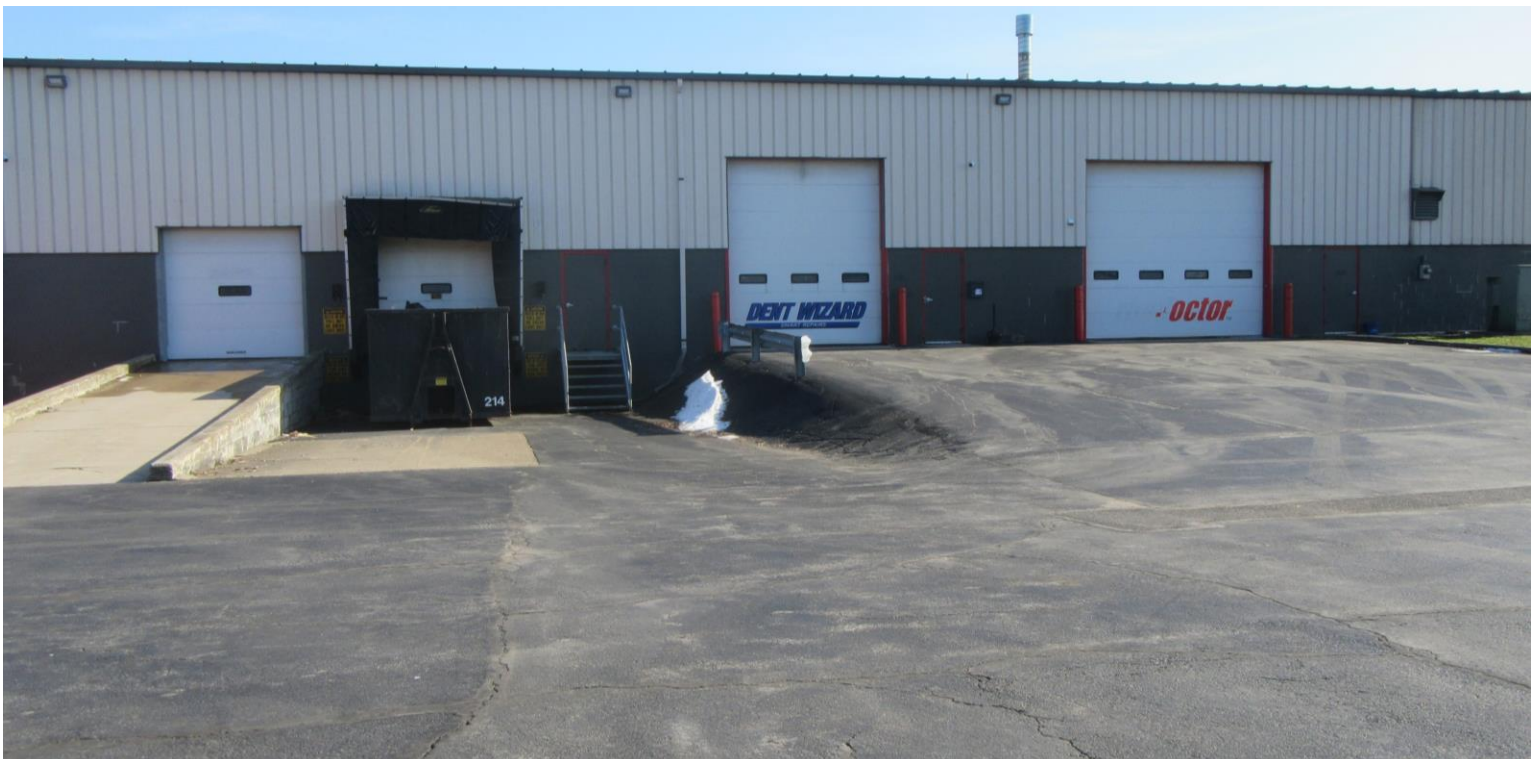
Ramp to be removed – 2 Docks, 2 Drive-in Doors (14' High)