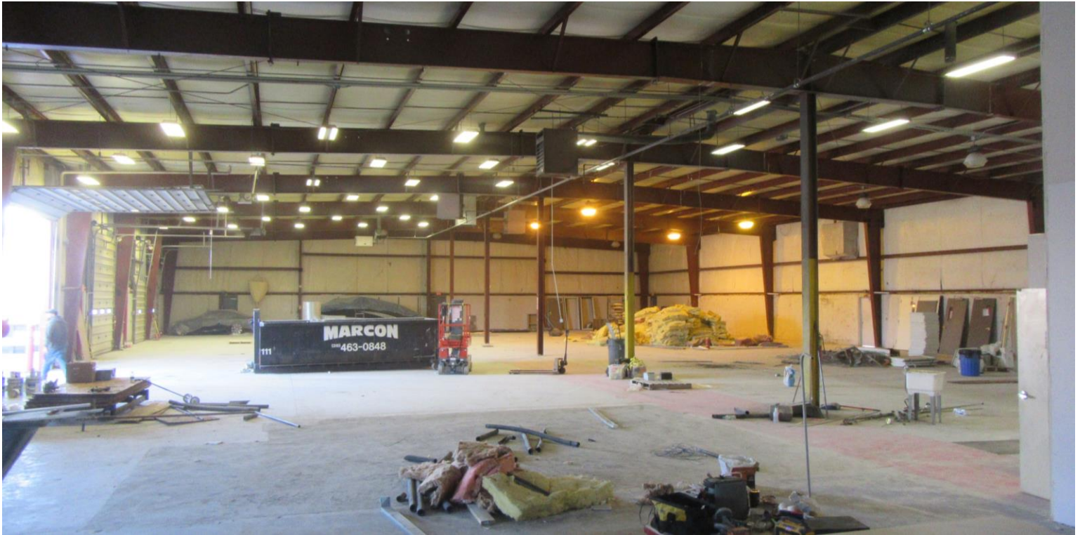
One Column Line 25'x50' Column Spacing