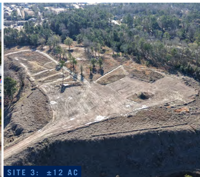
SITE 3: ±12 AC

Lease rate: $2,000 per month per acre NNN