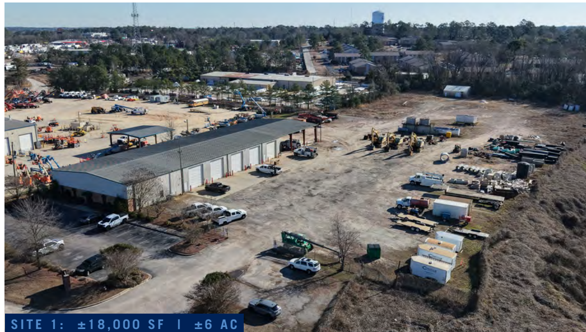
SITE 1: ±18,000 SF | ±6 AC