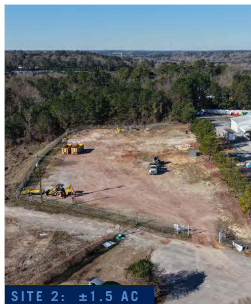
SITE 2: ±1.5 AC