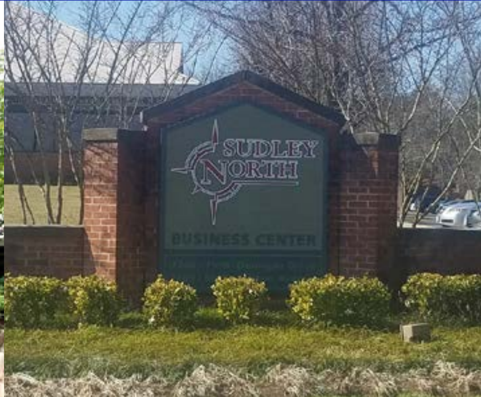
Building B - Lee Building 7848-7998 Donegan Drive