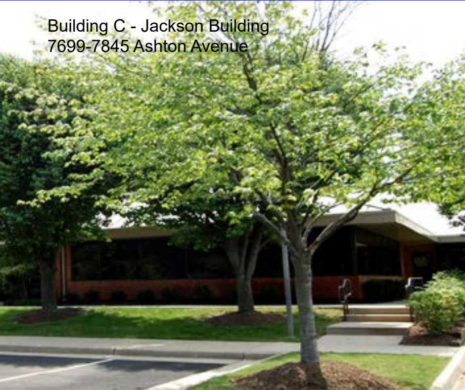
Building C - Jackson Building 7699-7845 Ashton Avenue