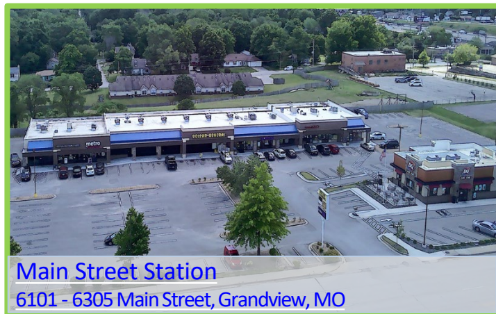
Main Street Station 6101 - 6305 Main Street, Grandview, MO