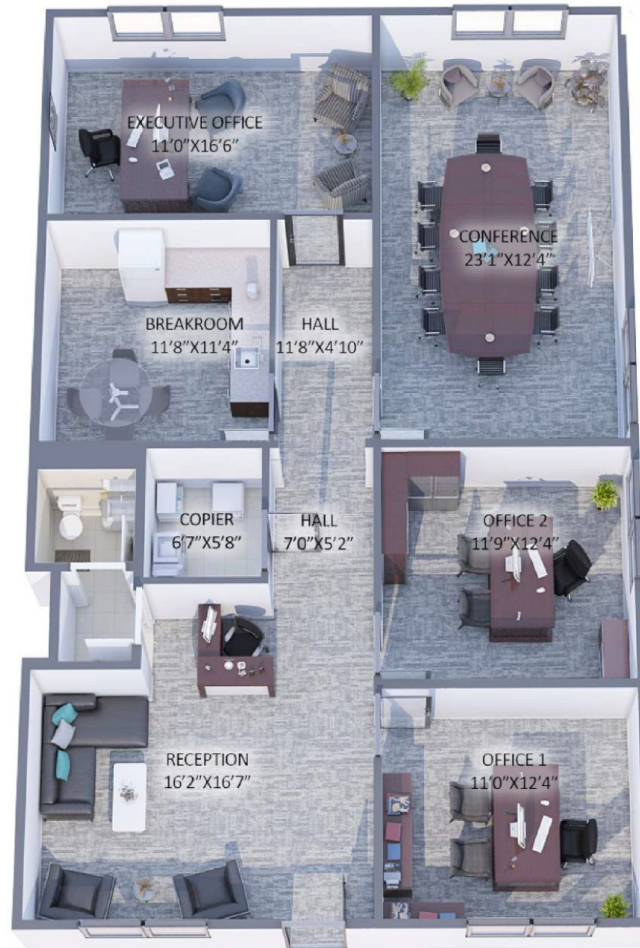
SUITE 401 - 1361 SQ. FT.

BACK BUILDING - SECOND FLOOR AVAILABLE SPACE