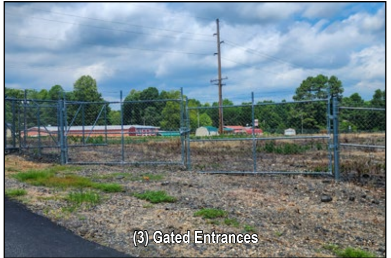
(3) Gated Entrances

9-53 Fenced Lot: 1.748 acre corner lot with excellent visibility and long frontage on VA-20 and B-A-H Rd. Completely fenced w/ (3) gated entrances along B-A-H Rd. Ideal for storage / laydown yard. Ideal for a nice stand alone lot or great addition to 9-60 (store) or 9-52 (self storage).