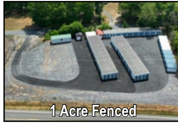
1 Acre Fenced

9-52 Spangler Self-Storage: 62 self storage units on 1.00 acre fenced lot with frontage on VA-20 and B-A-H Rd. Features include security gate, signage, paved drive, paved lot, and gravel parking for trailer, boat, and RV storage. Annual annual income in the $70ks with a potential annual income of $96k or more.