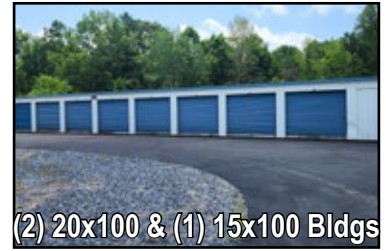
(2) 20x100 & (1) 15x100 Bldgs