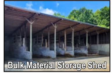
Bulk Material Storage Shed