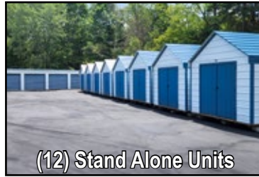
(12) Stand Alone Units