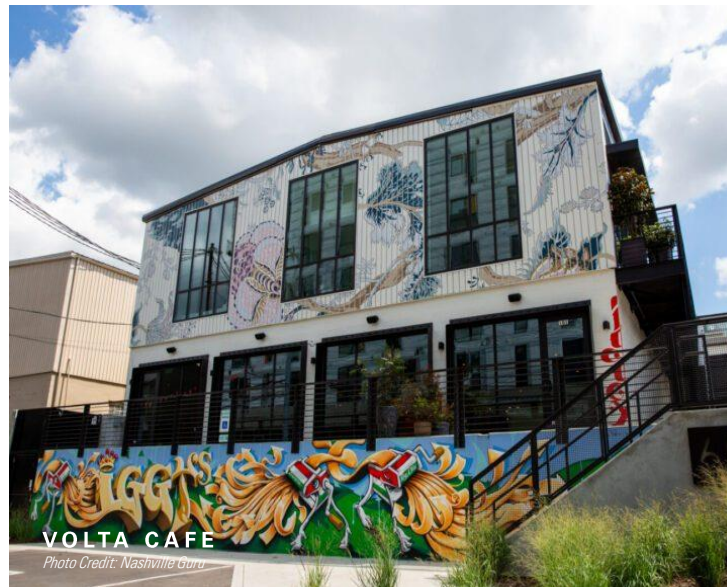
VOLTA CAFE