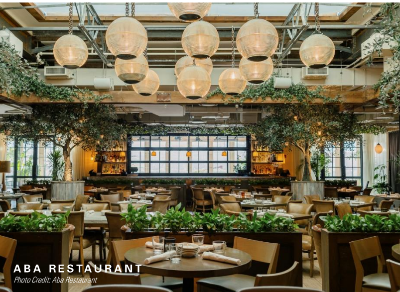
ABA RESTAURANT