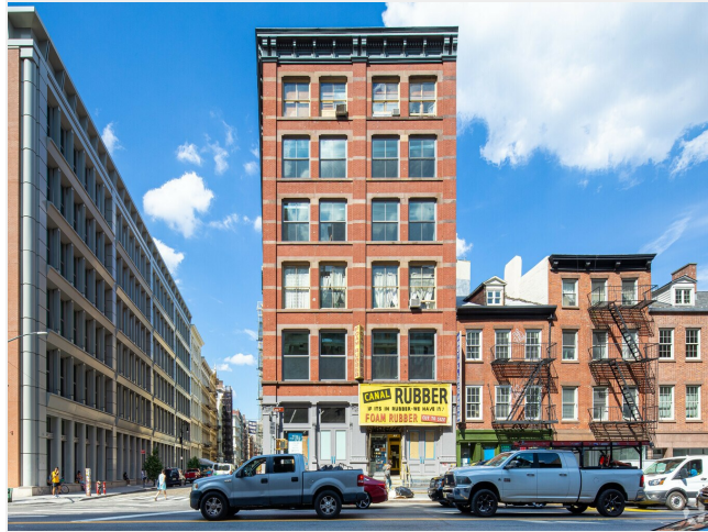
Boutique Office Building