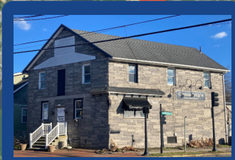
148 WEST BROAD STREET