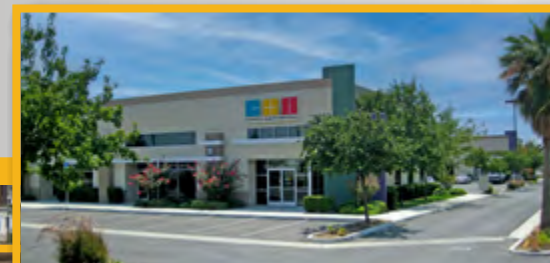
2809 Unicorn Road - Suite 108

2809 Unicorn Road - Suite 108 Bakersfield, CA