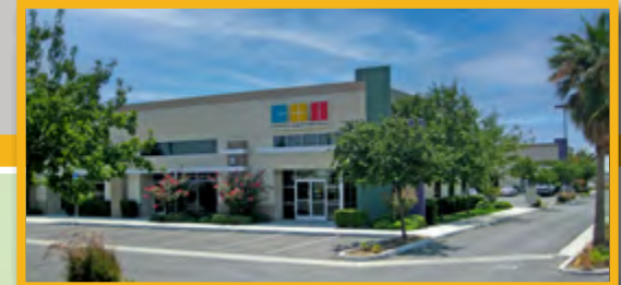
2809 Unicorn Road - Suite 108

2809 Unicorn Road - Suite 108 Bakersfield, CA