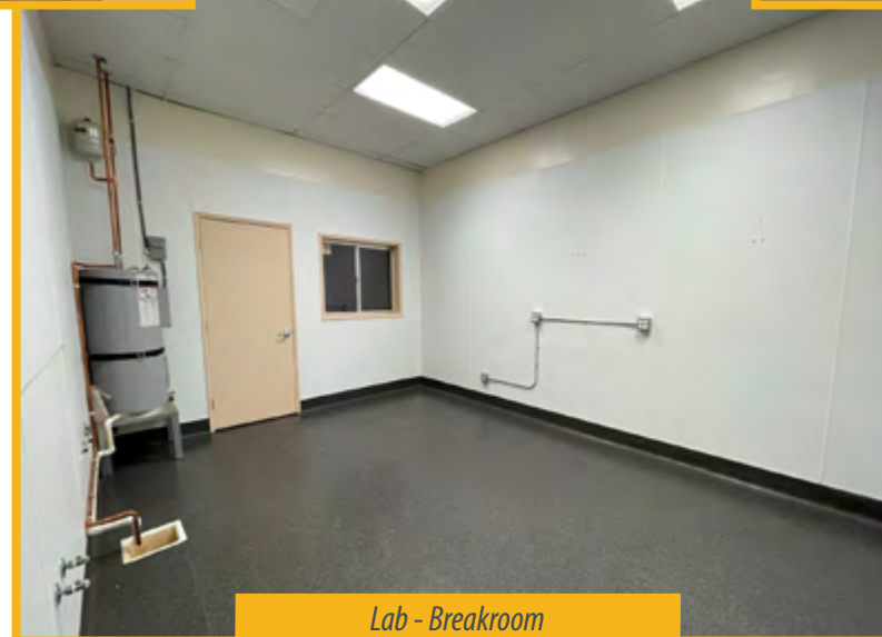
Lab - Breakroom