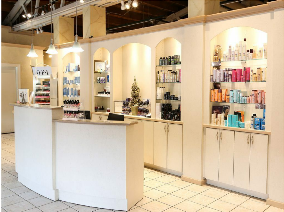
Marquiz Salon & Spa