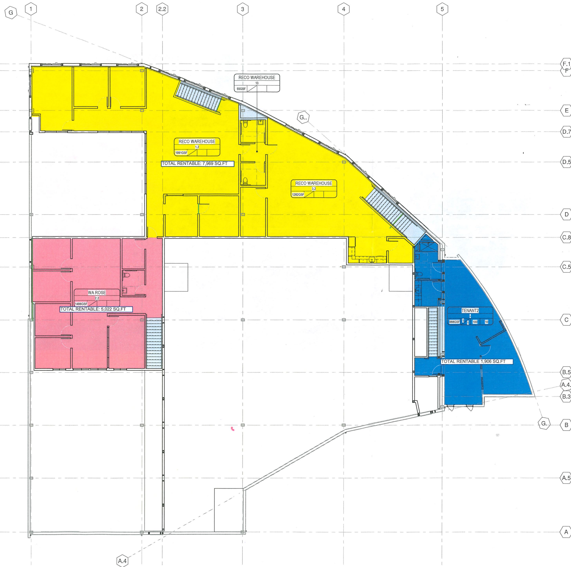
SECOND FLOOR - BOMA DIAGRAM 1/8" = 1'-0"