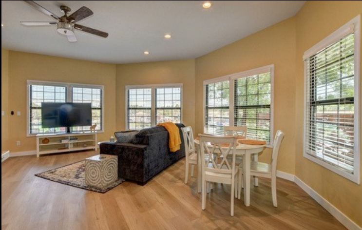
Unit 1- Living Interior

Total Annual Gross Rent: $65,820 with vacancy rate