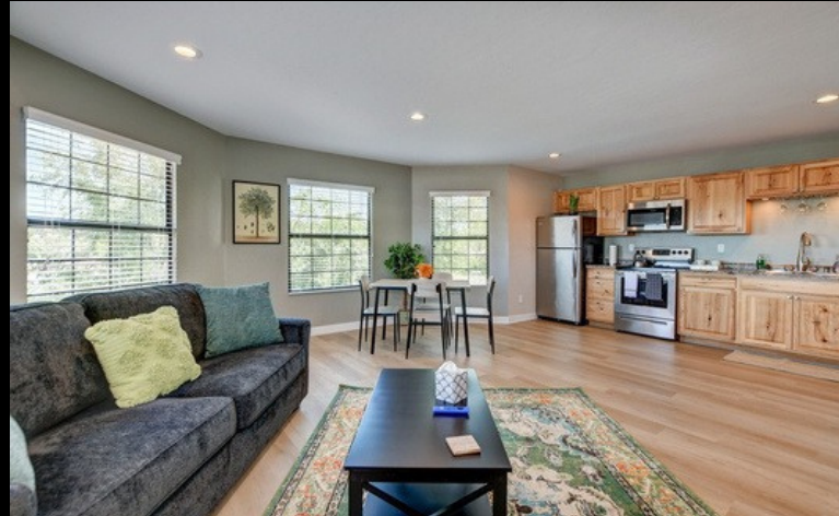
Unit 2- Living Interior