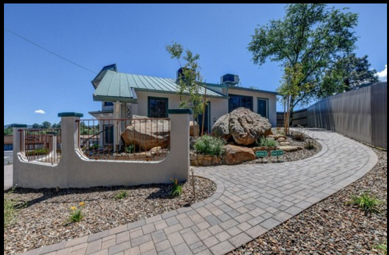
Exterior Unit 2 and Unit 3

Exclusively Listed By: Tom Semancik & Denise Raney