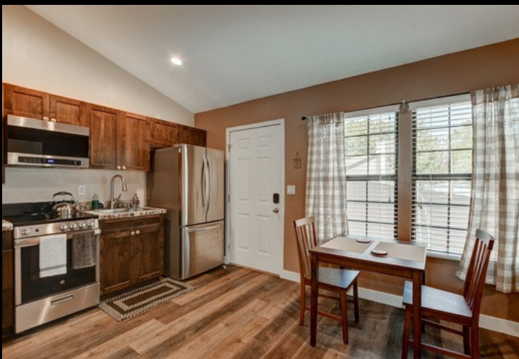
Unit 3- Living Interior