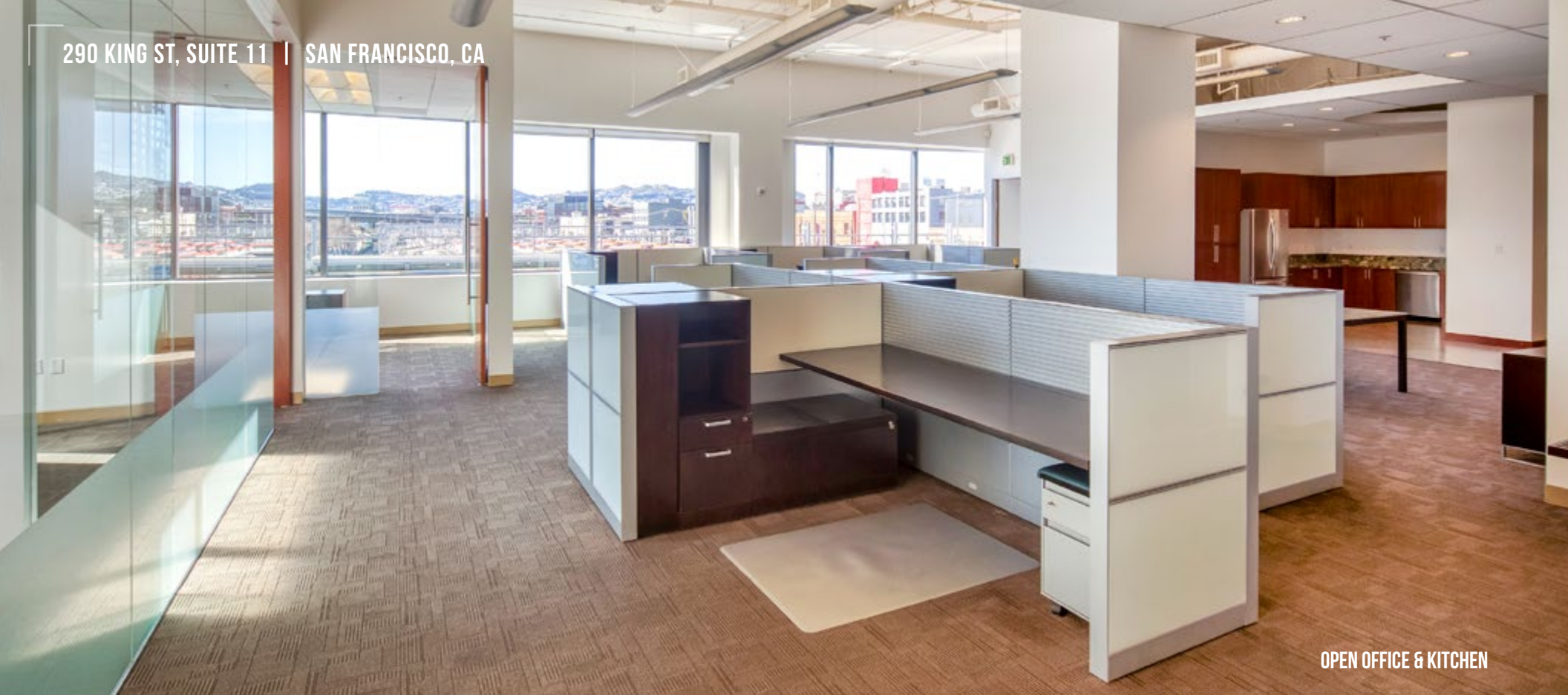
OPEN OFFICE & KITCHEN