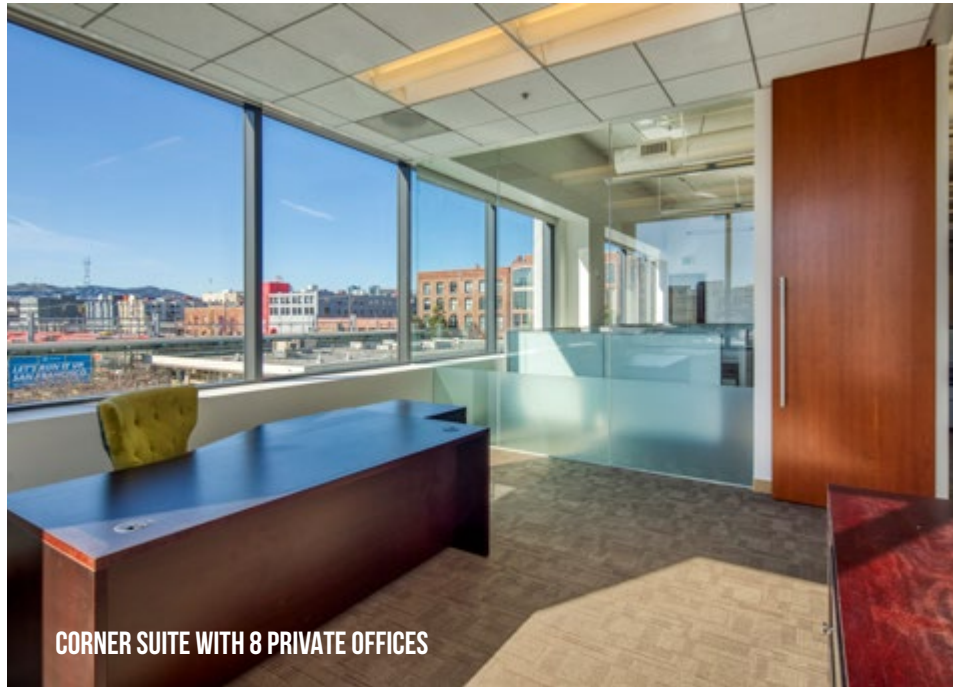
CORNER SUITE WITH 8 PRIVATE OFFICES