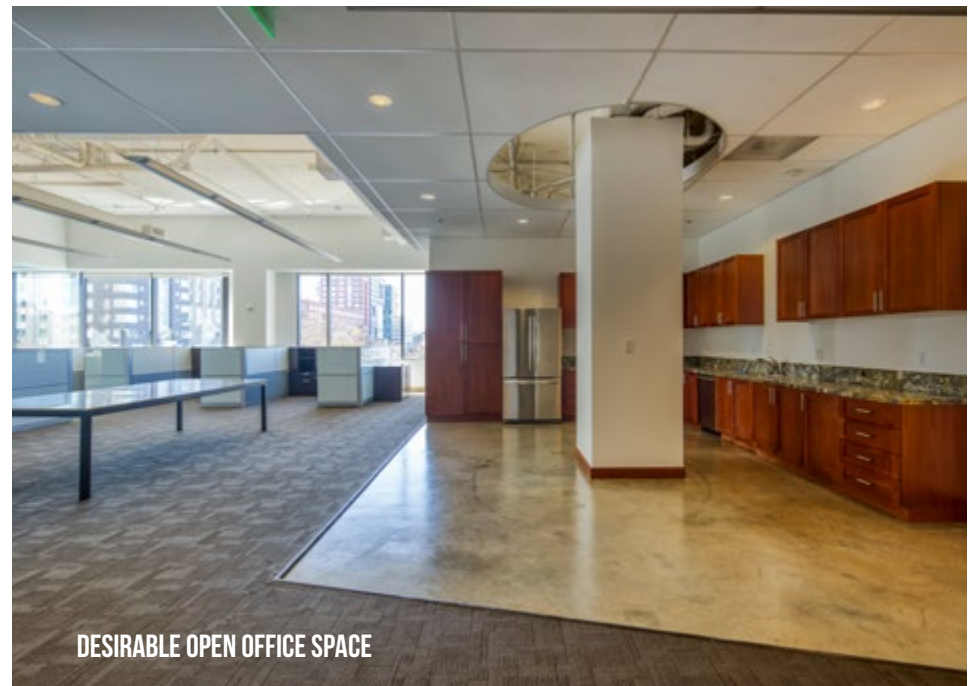
DESIRABLE OPEN OFFICE SPACE