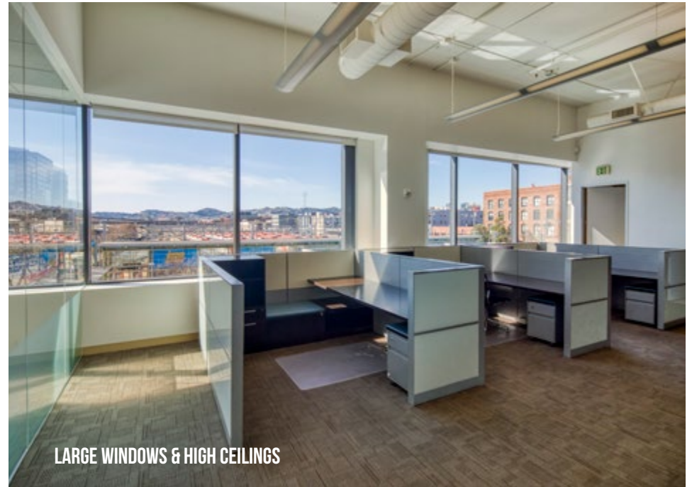
LARGE WINDOWS & HIGH CEILINGS